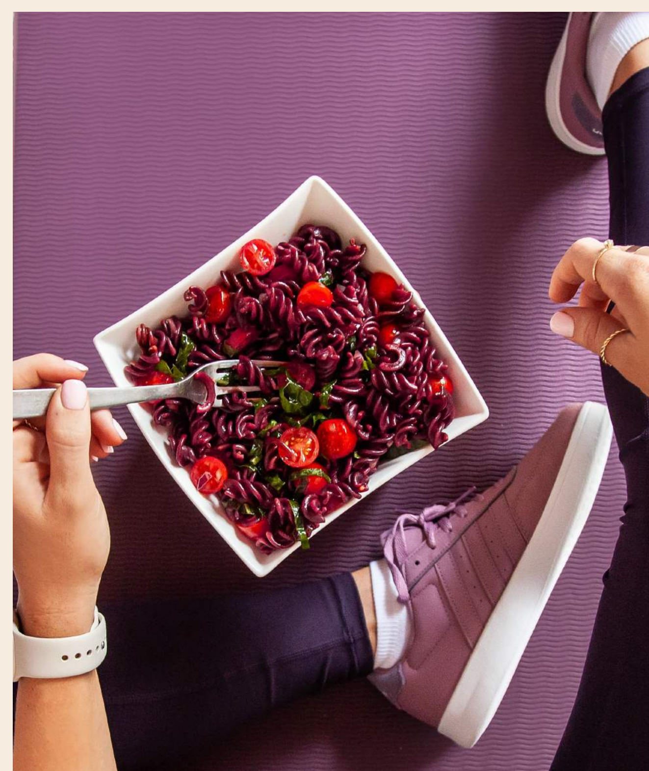
Yellow Pea & BEETROOT ROTINI