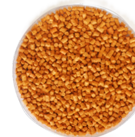
pellet Rekrill® orange