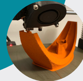
Table lamp, tray, glacette