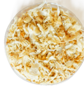
dried orange peels

The products made in Rekrill® become the concrete realization of a new production culture. They embody a history of circular economy and sustainability .