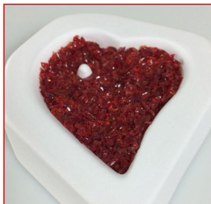
Before brushing away frit from the edges ...

Frit weights and firing: If you want to have a thick pendant that has some weight to it you should add more frit than you would if you wanted a thin and light pendant. Our firing schedule is for a full fuse which means that your mold needs to be filled with a frit weight that would be the same as two standard layers of glass- otherwise the glass will shrivel and not fill the mold cavity. If you do not want a thick pendant do not go to a full fuse. We have made a recommended frit weight table below for pendants firing to a full fuse, but really it is your preferential decision on the weights and the firing schedule especially if you find that your kiln fires hot. Many kilns do not fire the same as ours do, you may have a favorite full fuse schedule that works for you every time that you would rather use and that is great. To test your kiln and to see if it has discrepancies we have made a PDF tutorial that you may find worth your while reading- just click here. Once your frit has been added to your mold it is advisable to sweep away frit from the edges of the mold into the center with a small paint brush. This will prevent burrs from occurring on the edges of your pendant as the glass will melt and roll and create a smooth edge instead. If you do get some burrs, sanding then edges of your piece will help get rid of them. It is important to remember that the glass frit facing up in the kiln will be facing the viewer of the pendant.