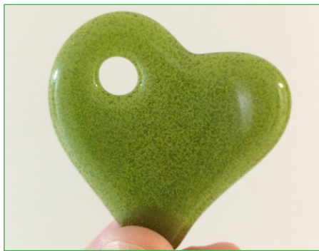
Holey mold made with only Fine Lime Transparent frit. See how it is not as clear as the heart on the right --> ?

Frit tip: We mostly use medium grain frit in our holey molds, this is because if you use mostly fine you will find you get more tiny bubbles upon firing and less clarity . Example: