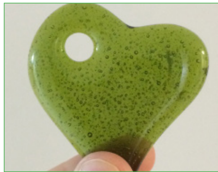
Holey mold made with Medium Lime Transparent frit.

P.s You dont have to just add frit to your holey mold! You can add stringers and peices of glass also. They would have to be small peices that you cut with a mosaic nipper.