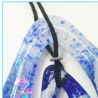
Step 2: Place the large pendant between both sides of the cord, on top of the spacer bead.