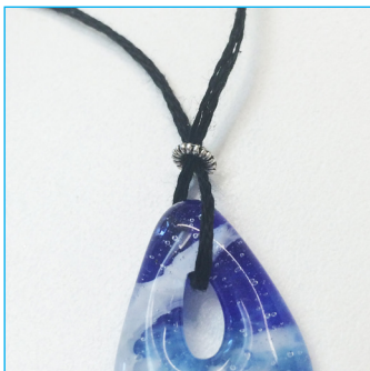
Step 1: Put both sides of the cord through a small spacer bead and run bead down the cords to the top of the small pendant.