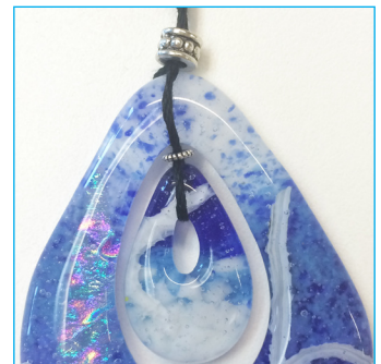
Step 4: If desired, hide the knot by placing a larger bead over it on the cords.

This same method works for stringing/beading just a single pendant too, all you have to do is adjust it a little to work for your single .