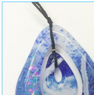
Step 3: Tie a knot in the cord just above the large pendant.