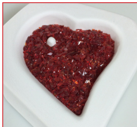
... after brushing frit from the edges.