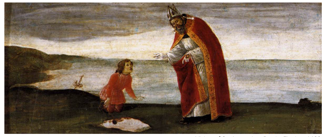
Vision of St. Augustine, Botticelli, circa 1488