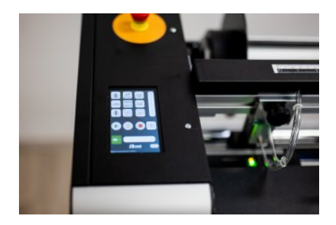
Touch screen control