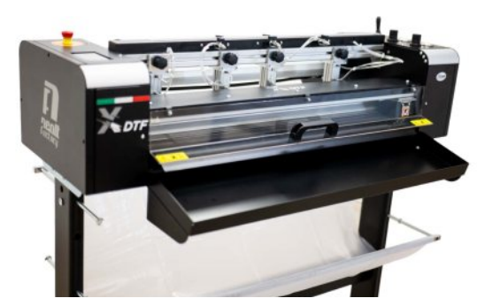
Copy collection tray