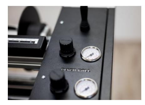
Adjustable pressure for pinch rolls and vertical blade