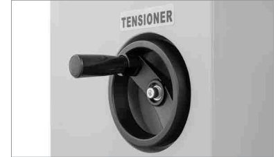
Felt tensioning adjustment