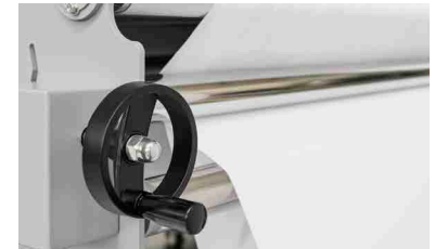
Fabric tensioning adjustment