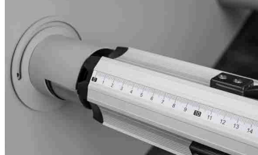
Millimeter scale on the shafts for the right positioning of the rolls