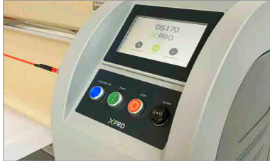
Easy to use touch screen display