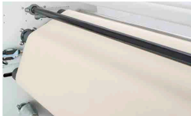
High quality felt belt