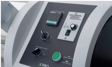
Easy to use temperature and speed control panel