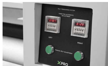
Felt belt automatic tracking system