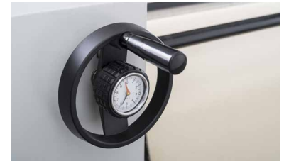
Felt tensioning adjustment with pressure gauge