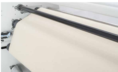
High quality felt belt