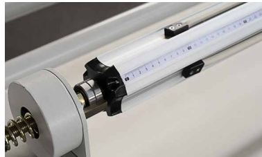
Millimeter scale on the shaft for the right positioning of the rolls