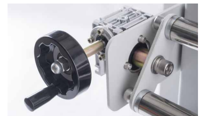
Fabric tensioning adjustment