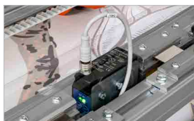
Advanced cutting mark reader