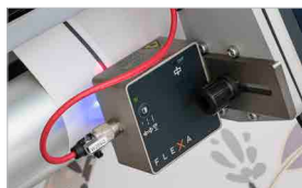
Optical sensor for vertical alignment