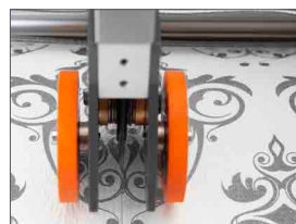
Single lengthwise rotary crush cutter (twin cutters optional)