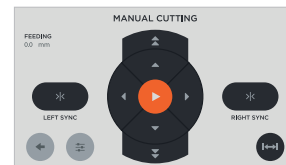
User-friendly software design