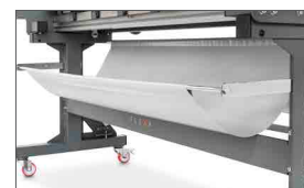
Clean working area thanks to the big waste basket