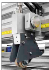
Slimline lengthwise rotary crush cutter, single or twin, (optional)