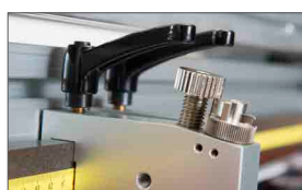
Fine pressure adjustment (according to the types of material)