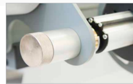
Adjustable unwinding shaft (optional)

Can be fitted with: (optional): 1. Motorized Stacker in line with the cutter: height and inclination electronically adjustable; extensible length up to 3,2 meters 2. Folding collecting table 3. NEW Tilttable collecting table with wheels