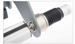
Unwinding shaft brake for adjusting the tension of the material