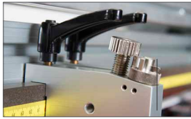
Fine pressure adjustment (according to the types of material)