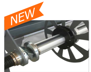
Heavy duty unwinding shaft for rolls Ø 400 mm up to 90 kg weight (optional)