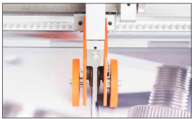
Single lengthwise rotary crush cutter (twin cutters optional)