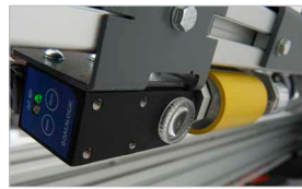
Advanced cutting mark reader