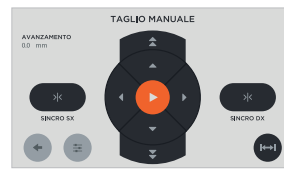
User-friendly software design