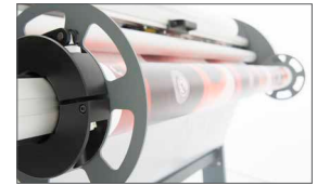
Aluminium 3" shaft with flanges for the right alignment of the roll