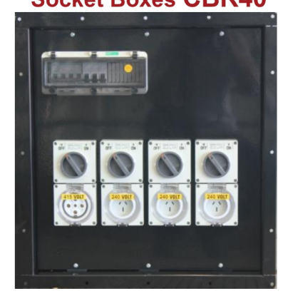
Socket type 3 x 15A 2P + T 1 x 32A 3P + N + T