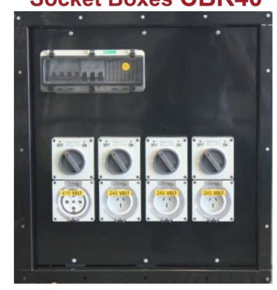
Socket type 3 x 15A 2P + T 1 x 32A 3P + N + T