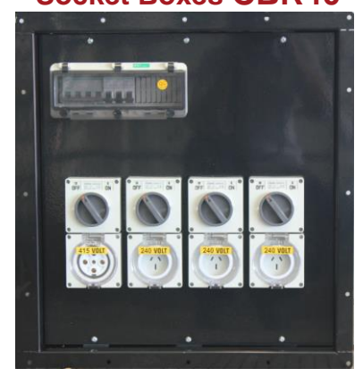
Socket type 3 x 15A 2P + T 1 x 32A 3P + N + T