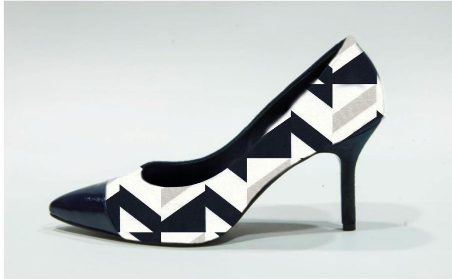
NAVY,TAUPE & OATMEAL GRAPHIC VINTAGE AIRLINE PRINT USD$ 165