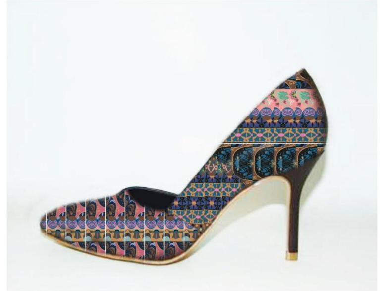
MULTI-COLOR PATCHWORK ART NOUVEAU PRINT USD$ 165