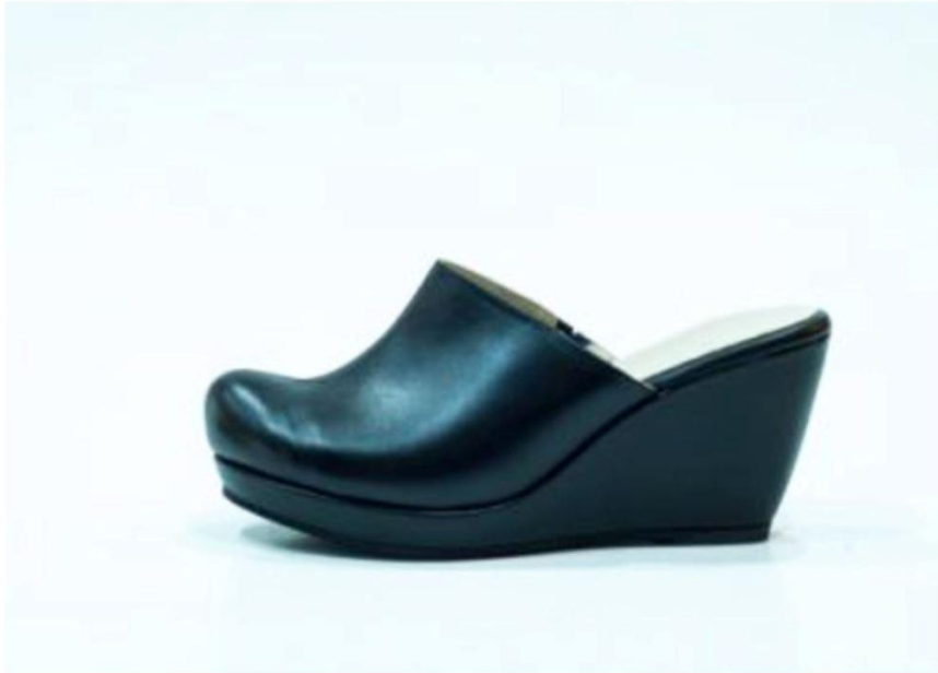
BLACK CAMEL NUDE FAUX LEATHER $USD 145