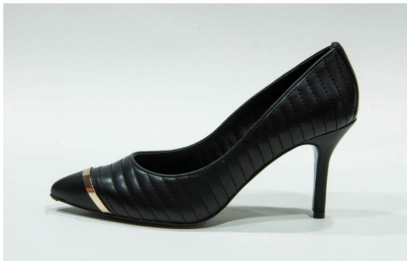
BLACK CAMEL WINE FAUX LEATHER USD$125