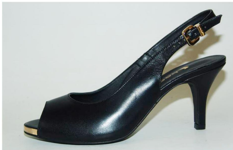
BLACK RUST NAVY FAUX LEATHER USD$125