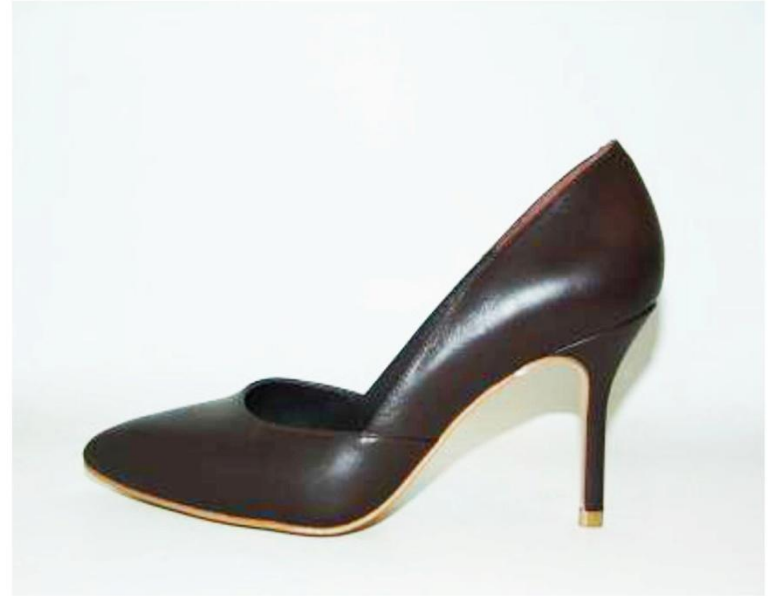
BLACK BROWN NUDE FAUX LEATHER $USD 155