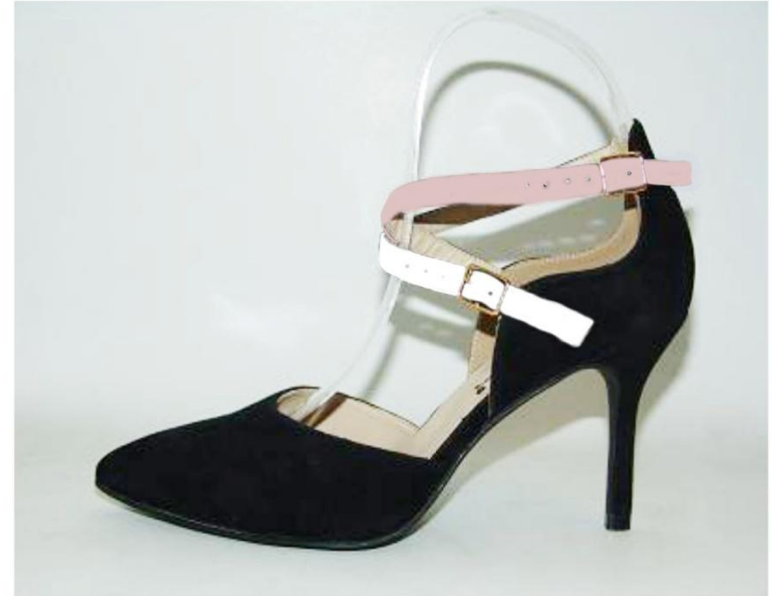
BLACK,WHITE,PEACH & PRINT USD$ 185