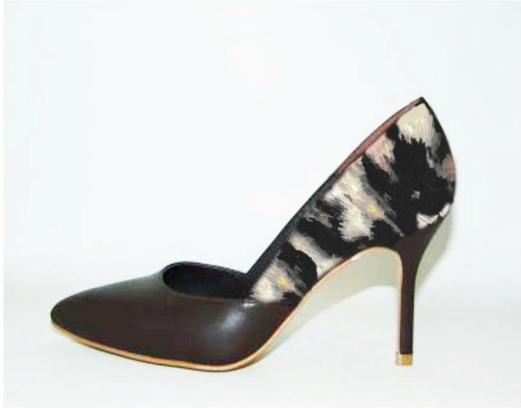
BLACK & WHITE ABSTRACT ANIMAL PRINT USD$165