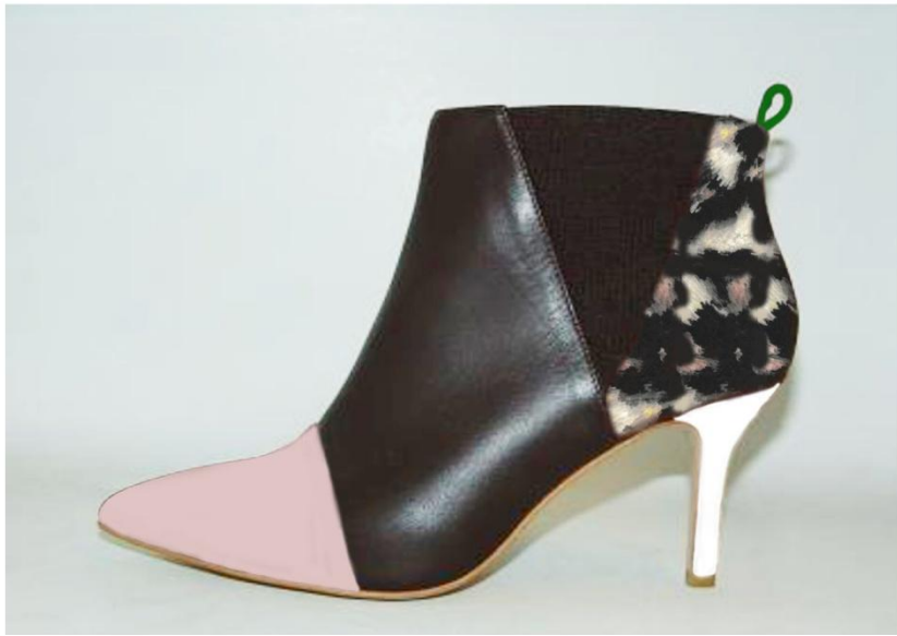
BLACK,WHITE,PEACH & PRINT USD$ 185