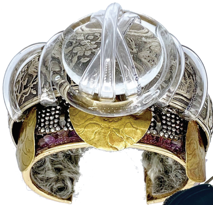
Neptune Cuff $395

Our Pick: Style this Studio Anastasia McNeal cuff bracelet with a crisp button-down while at your desk, and swap in a low-slung tank for drinks when the clock strikes five.