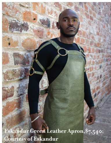
Eskandur Green Leather Apron, $7,540

Our Pick: Eskandur played with gender codes via suede, apron-like dresses in neutral and bold tones. Layered over trousers, shirt, and tie, it was a new take on a work uniform, merging the leather apron of a welder with a three-piece suit — perhaps a comment on class as much as on gender codes. Notably, these examples were made from materials traditionally associated with menswear and workwear, allowing for gender exploration while maintaining a degree of satorial futurism.