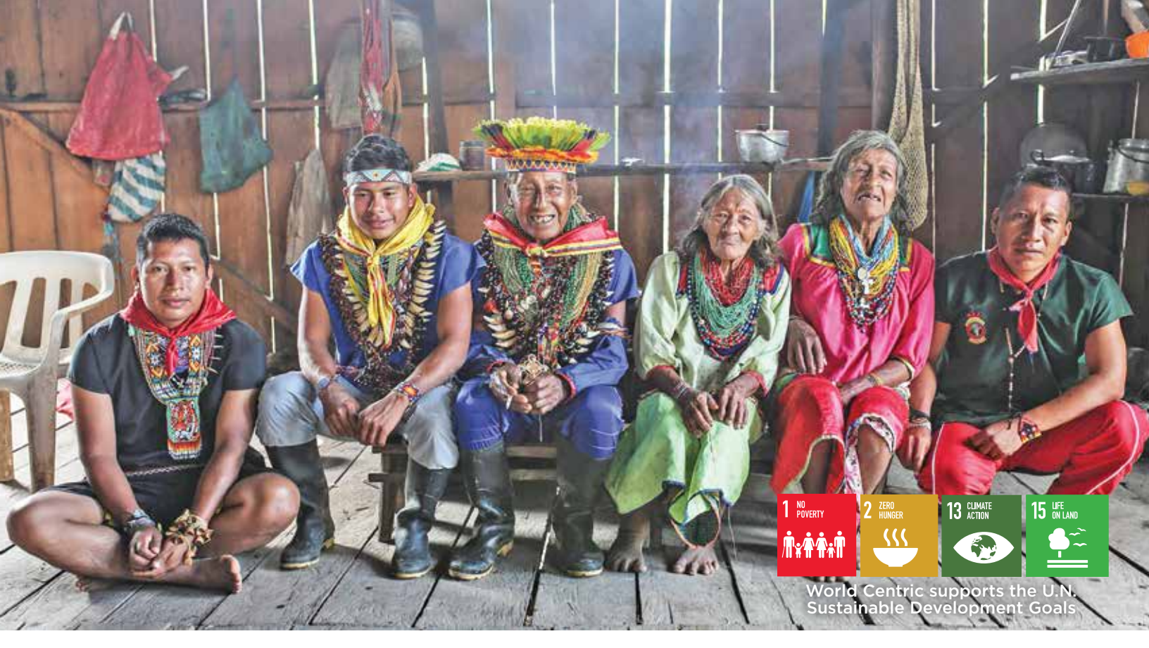
A'i Cofan traditional healers and youth in the Ecuadorian Amazon.