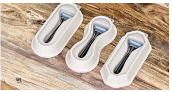
We offer customized solutions for retail and online channels. Iconic and sustainable forms are designed around your products to help stand out in your social media streams.