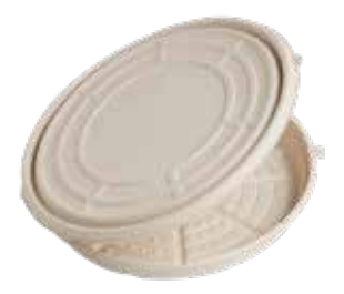
PizzaRound® Clamshell and Two-Part Pizzaround SKUs: PR-SC-12, PR-SC-14 U.S. Patent No. D843.207. D843.207