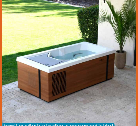
Install on a flat level surface, a concrete pad is ideal

Move your Chilly GOAT into place and wait 24 hours before beginning the start-up process.