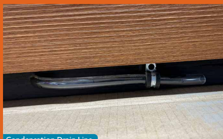
Condensation Drain Line

It is normal for there to be condensation. To protect your cold tub, you need to connect the manufacturer installed drain line. You'll find the drain line on the long side of the Chilly GOAT below the cabinet. Attach the provided clear 3/8" ID hose to couple and route the drain line away from the unit, making sure not to allow water to return toward the Chilly GOAT.