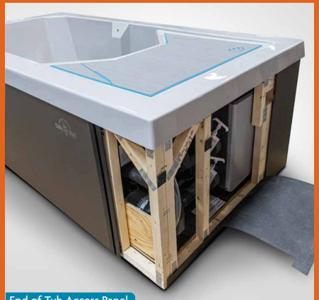
End of Tub Access Panel

Remove one skirt cabinet panel, and one trim strip to access the equipment. The equipment end panel will be the short side with the top deck, and it is the primary access point for most equipment and startup processes. First unscrew the trim strip. Then, remove the panel by lifting up the section until it stops and then pulling the bottom outward at an angle to unhook it from the channel. With skirt panel removed from the equipment end, you can check that all unions are secure. Also, check that all slice valves are open and in the up position. These connections and valves can shift or loosen during the shipping process. Before filling, make sure the internal ball valve, between the circulation pump and heat pump, is in the open position. This valve should be turned to its open position, handle in-line with the plumbing, when filling and draining. It needs to be in the closed, perpendicular handle position when the unit is running.