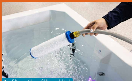
Pre-filter w/ hose filling cold tub

Before plugging in and powering up, turn the internal ball valve to its closed position.