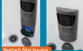
Reattach filter housing