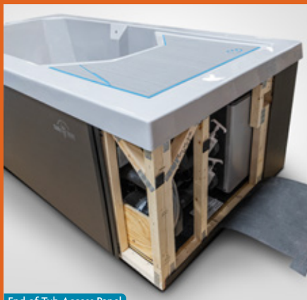
End of Tub Access Panel

Before starting the filling process be sure to remove the filter.