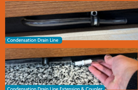
Condensation Drain Line

It is normal for there to be condensation. To protect your cold tub, you need to connect the manufacturer installed drain line. You'll find the drain line on the long side of the Chilly GOAT below the cabinet. Attach the provided clear 3/8" ID hose to couple and route the drain line away from the unit, making sure not to allow water to return toward the Chilly GOAT.