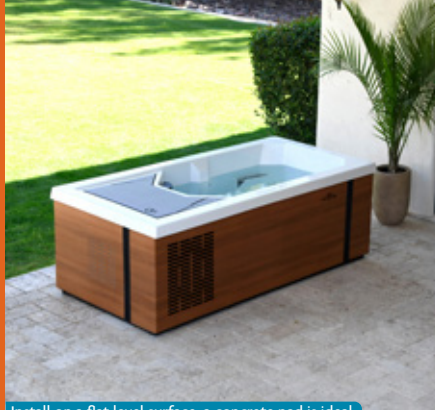
Install on a flat level surface, a concrete pad is ideal

When choosing a location, it's also important to consider the length of the power cord and space for access and ventilation. The Chilly GOAT cord is 12 feet long. In addition, Master Spas recommends having 6 feet of clearance on the front side for adequate ventilation of the heat pump and 2 feet of access on the other sides.