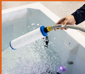
Use pre-filter while filling both sides of Chilly GOAT