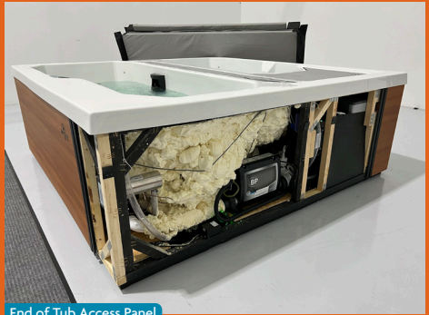
End of Tub Access Panel

With the equipment access panel removed, check that all pump and heater unions are secure. The therapy pump, heater, and chiller each have two unions. The unions might become loose during transportation. Also, check that all slice valves are open in the up position. The slice valves might be closed during the transportation of the Chilly GOAT.