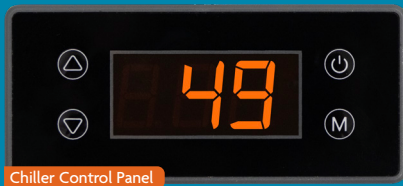
Chiller Control Panel

You can press the “M” button to switch between the heating and cooling modes.