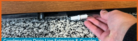
Condensation Drain Line Extension & Coupler