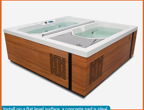
Install on a flat level surface, a concrete pad is ideal

Move your Chilly GOAT into place and wait 24 hours before beginning the start-up process.