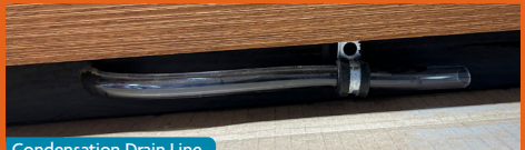
Condensation Drain Line

It is normal for there to be condensation. To protect your Valaris, you need to connect the manufacturer installed condensation line. The condensation drain can be found below the skirting panel that runs the length of the cold tub. Attach the provided clear 3/8" ID hose to coupler and route the drain line away from the unit.