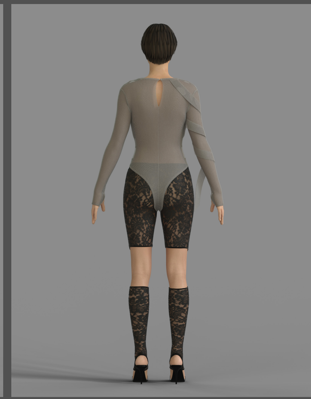
MODEL WEARS THE OVERLAY BODYSUIT AND SECOND SKIN LEGGINGS SIZED S IN STONE MESH AND BLACK LACE