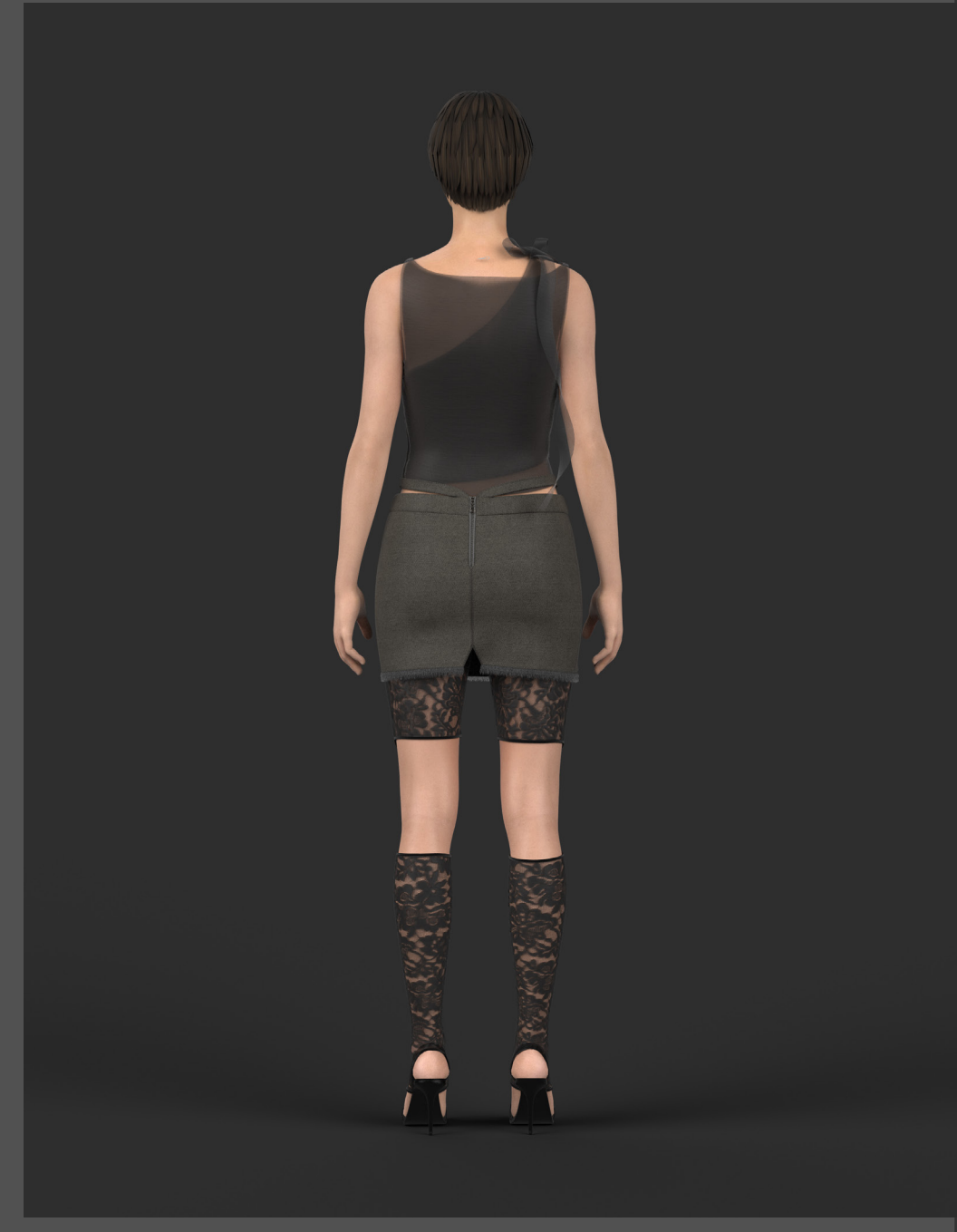
MODEL WEARS THE BOW TOP, RIDING SKIRT AND SECOND SKIN LEGGINGS SIZED M IN BLACK MESH, DENIM AND BLACK LACE