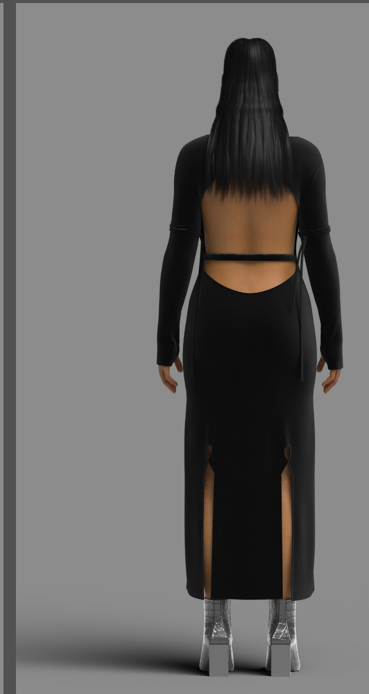
\begin{array}{c} \text{model wears the MIDNIGHT MAXI DRESS sized L} \\ \text{in black velvet} \end{array}