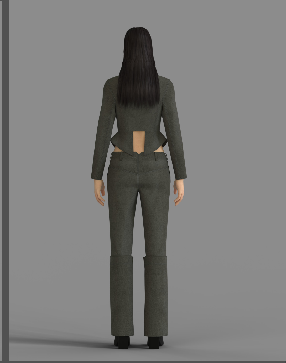
MODEL WEARS THE BUTTERFLY JACKET AND SHOWDOWN JEANS SIZED XS IN DENIM