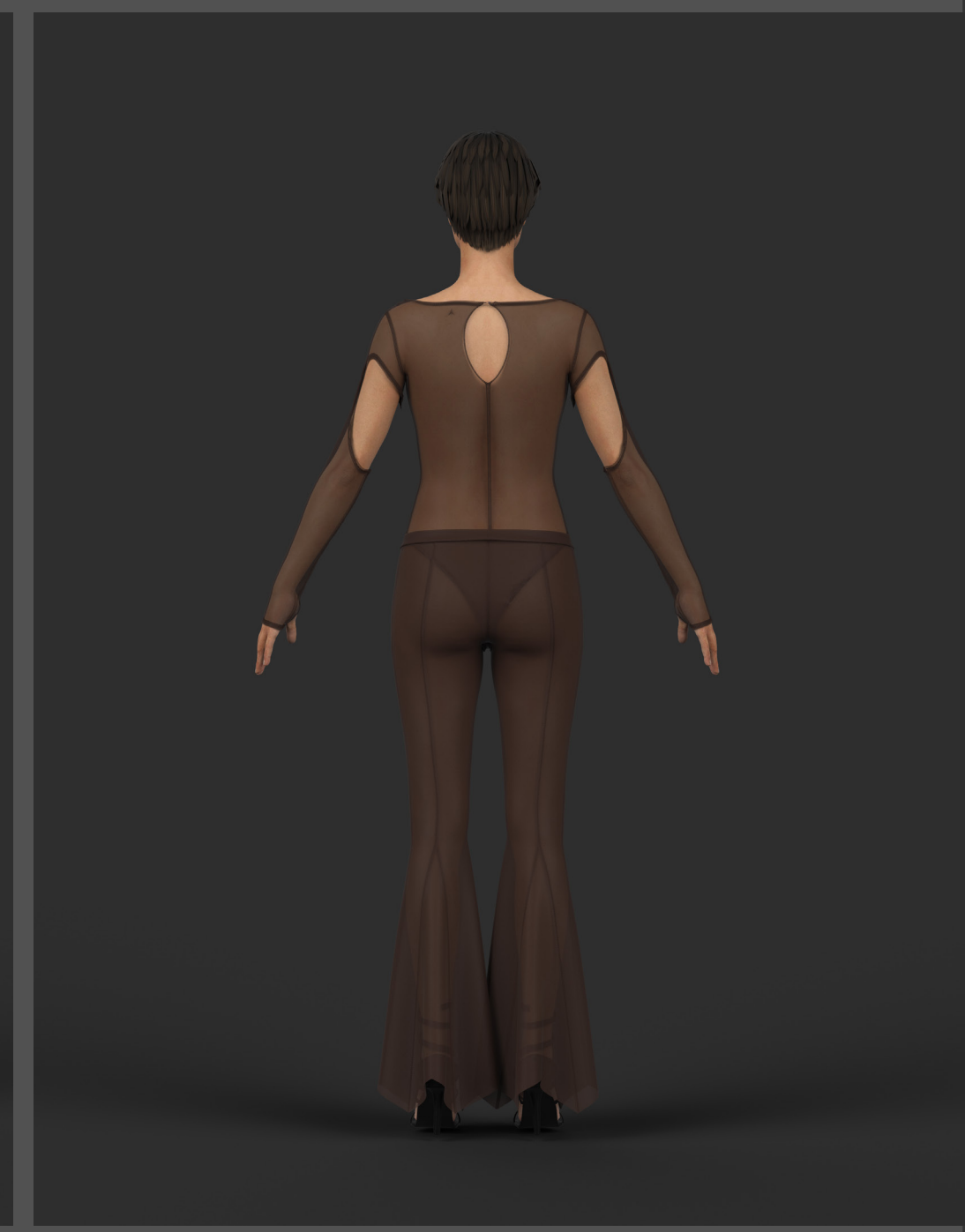
MODEL WEARS THE TERACOTTA BODYSUIT AND TROUSERS SIZED M IN TERACOTTA MESH