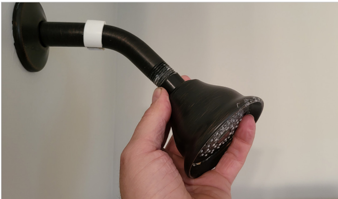
3 Unscrew shower head