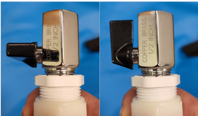
5 Turn ball valve from off to on position