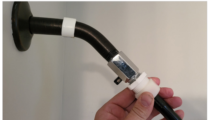
4 Attach ball valve to shower stem