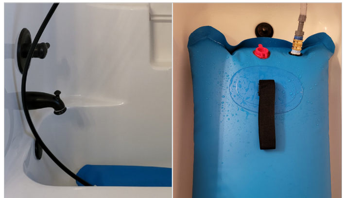
6 Turn water on and fill (DO NOT OVERFILL) Image to the right is a tank filled to capacity