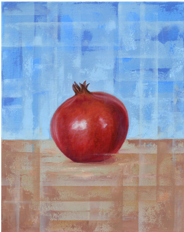
Pomegranate | Oil on Canvas | 12" x 9"