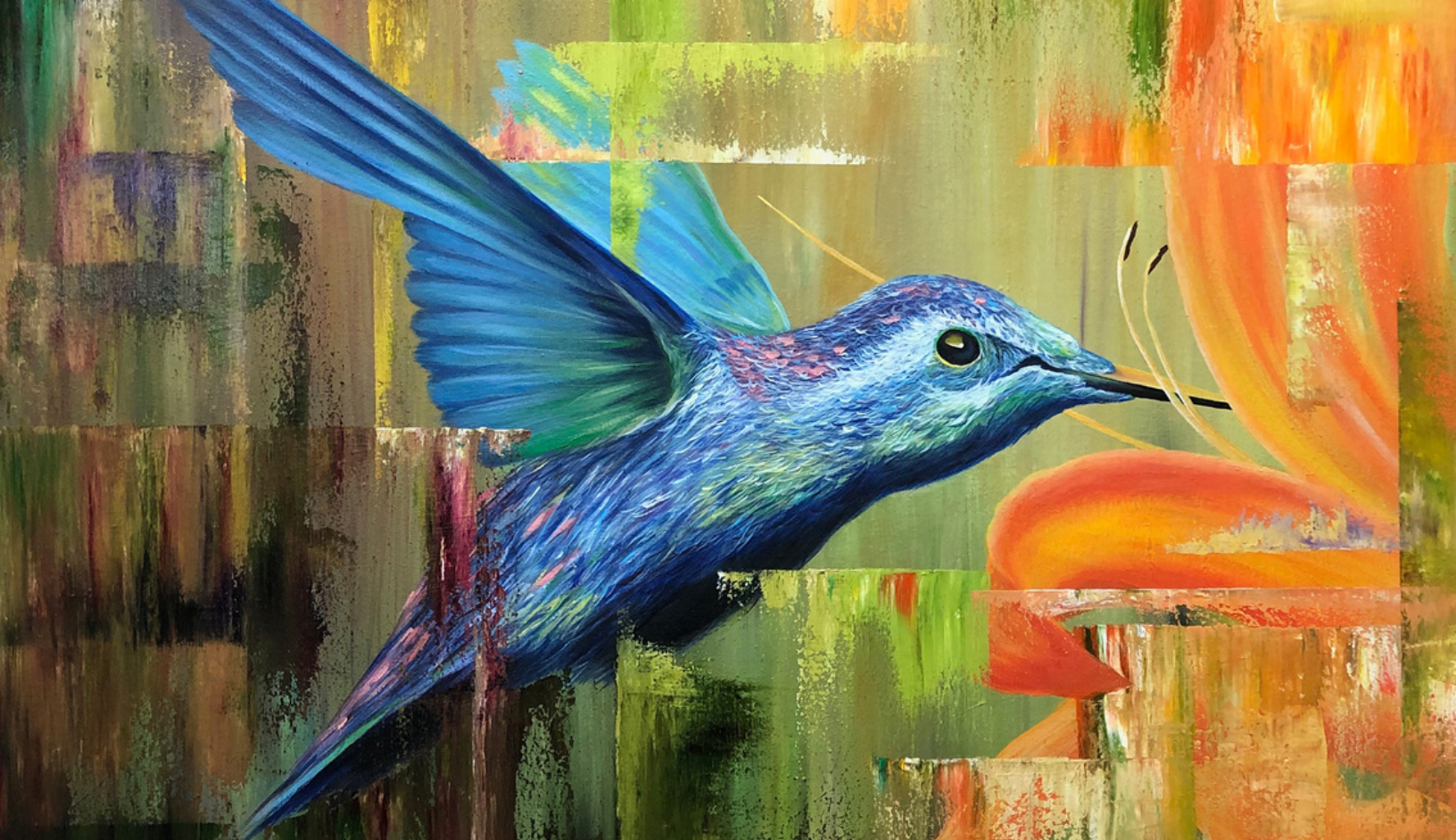
Hummingbird | Oil on canvas | 24" x 30"