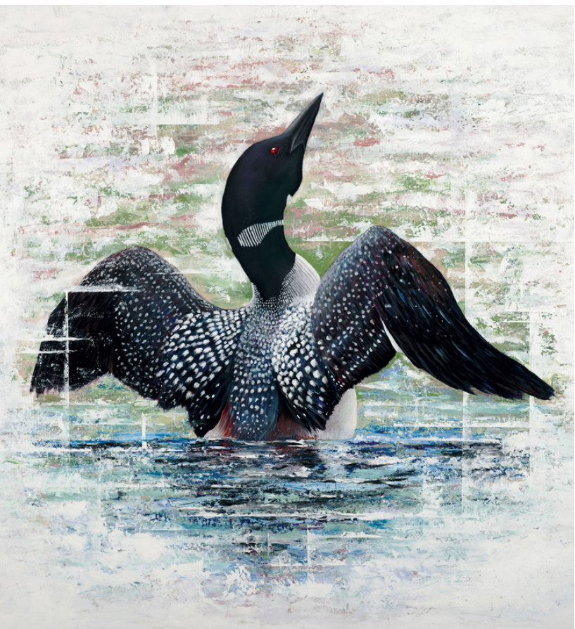
Lake Loon | Oil on Wood Panel | 30" x 30"