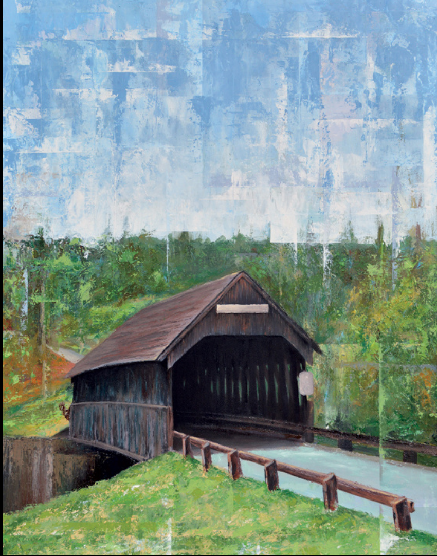
Meriden, NH Covered Bridge | Oil on Wood Panel | 24" x 18"