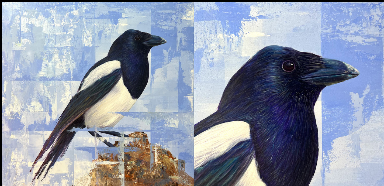
Magpie | Acrylic on Wood Panel | 24" x 18"