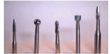
TUNGSTEN CARBIDE BURRS 422D1 422D2 422D3 422D4 422D5