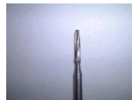
VULCANITE ANTI-CLOG BURR 419D1