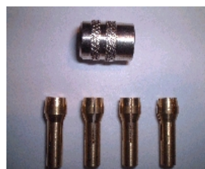
587D1 UNIVERSAL 3 JAW CHUCK For use with Microturbo 2 & Microturbo 5 drills. 418D3 CHUCK 418D2 SET OF COLLETS