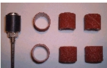
DRUM SANDER (INC MANDREL) & SPARE SANDING BELTS. 533D 534D (FINE) 535D (COURSE)