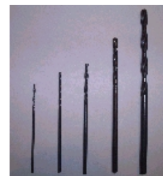
HIGH SPEED TWIST DRILLS WHEN ORDERING QUOTE 406D e.g. 406D23 = 2.3mm sizes available. .8mm, 1.0mm, 1.2mm, 1.3mm, 1.5mm, 1.8mm, 2.0mm, 2.2mm, 2.3mm, 2.4mm also:- 2.5, 2.6, 2.7, 2.8, 2.9, 3.0, 3.1, 3.2, 3.3, 3.4, 3.5.