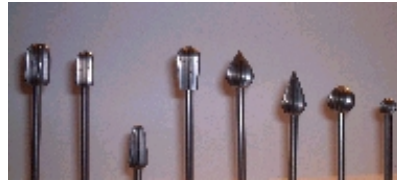
VULCANITE ANTI-CLOG BURRS 419D2 419D3 419D4 419D5 419D6 419D7 419D8 419D9