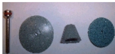
414D1 416D1 416D2 416D3 SILICONE RUBBER POLISHING WHEELS