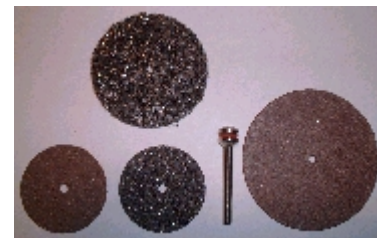
ABRASIVE DISCS 412D1 413D1 414D1 415D1