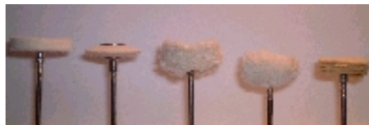
BUFFING WHEELS 554D 555D 556D 423D 553D