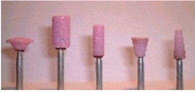
MOUNTED ABRASIVES 407D1 407D2 407D3 407D4 407D5