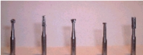
PLAIN STEEL BURRS 410D1 410D2 410D3 410D4 410D5