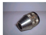
587D1 UNIVERSAL 3 JAW CHUCK For use with Microturbo 2 & Microturbo 5 drills.