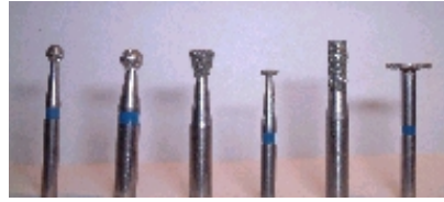
DIAMOND TIPPED BURRS 421D1 421D2 421D3 421D4 421D5 421D6