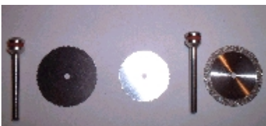
414D1 409D1 409D2 557D SAW BLADES DIAMOND CUTTING WHEEL