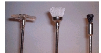
BRISTLE BRUSHES 546D 550D 547D NYLON BRUSHES 545D 551D 548D