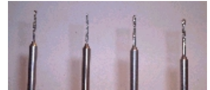
DIAMOND SPIRAL BURRS 558D8 (0.8mm) 558D9 (0.9mm) 558D10 (1.0mm) 558D12 (1.2mm)