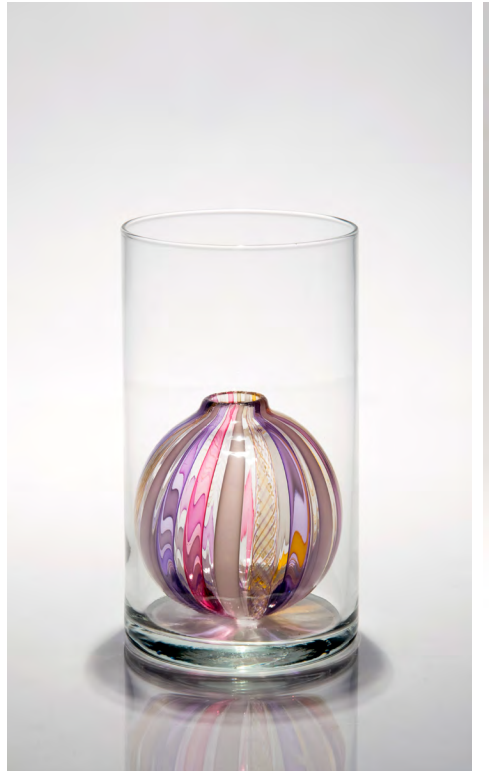
Single Globe in Pink/Purple Stripe Clear vase is 6" tall x 3.5" wide, bead is 3" tall