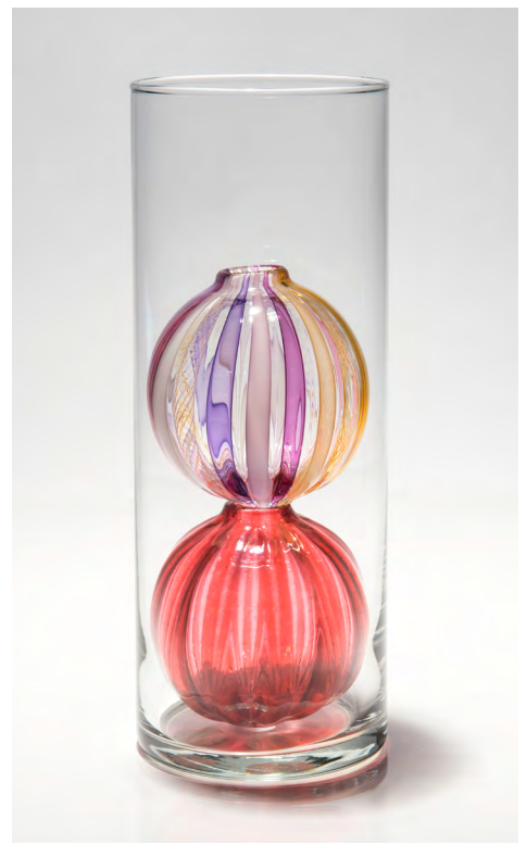
Double Globe in Pink/Purple Stripe and Rose Clear vase is 9" tall x 3.5" wide; each bead is 3" tall