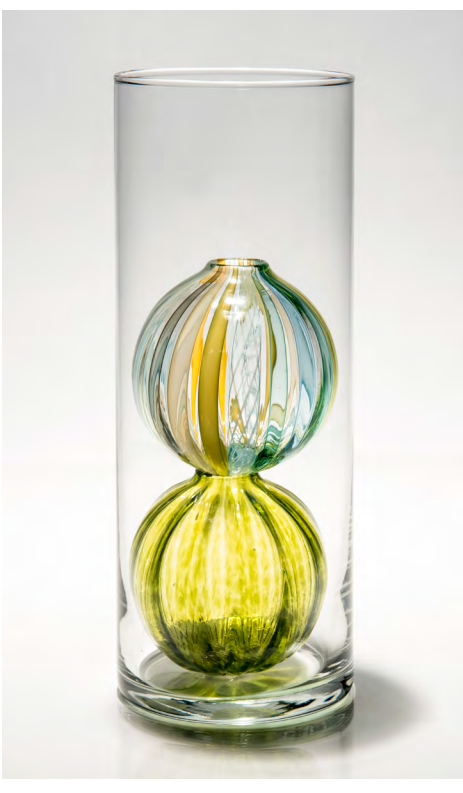
Double Globe in Turquoise/Celery Stripe and Celery Clear vase is 9" tall x 3.5" wide; each bead is 3" tall