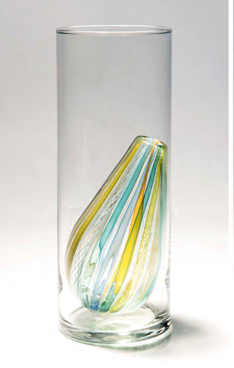
Large Teardrop in Turquoise/Celery Stripe Clear vase is 9" tall x 3.5" wide, bead is 5.5" tall