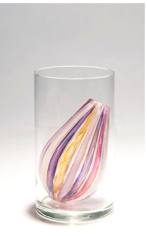
Medium Teardrop in Pink/Purple Stripe Clear vase is 6" tall x 3.5" wide, bead is 4" tall