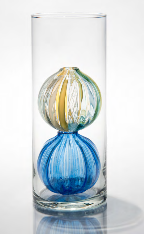
Double Globe in Turquoise/Celery Stripe and Light Blue Clear vase is 9" tall x 3.5" wide; each bead is 3" tall