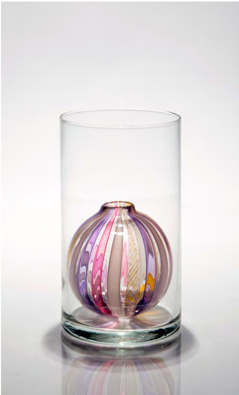
Single Globe in Pink/Purple Stripe Clear vase is 6" tall x 3.5" wide, bead is 3" tall