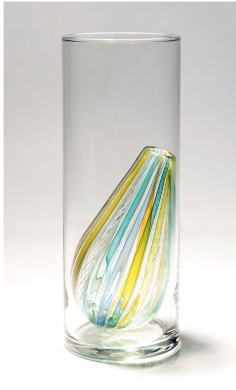
Large Teardrop in Turquoise/Celery Stripe Clear vase is 9" tall x 3.5" wide, bead is 5.5" tall