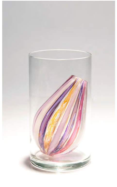
Medium Teardrop in Pink/Purple Stripe Clear vase is 6" tall x 3.5" wide, bead is 4" tall