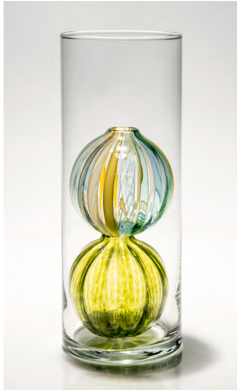
Double Globe in Turquoise/Celery Stripe and Celery Clear vase is 9" tall x 3.5" wide; each bead is 3" tall