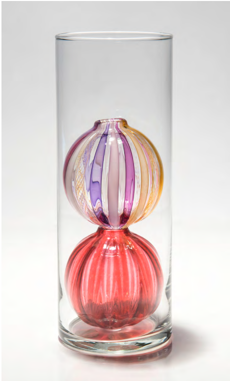
Double Globe in Pink/Purple Stripe and Rose Clear vase is 9" tall x 3.5" wide; each bead is 3" tall