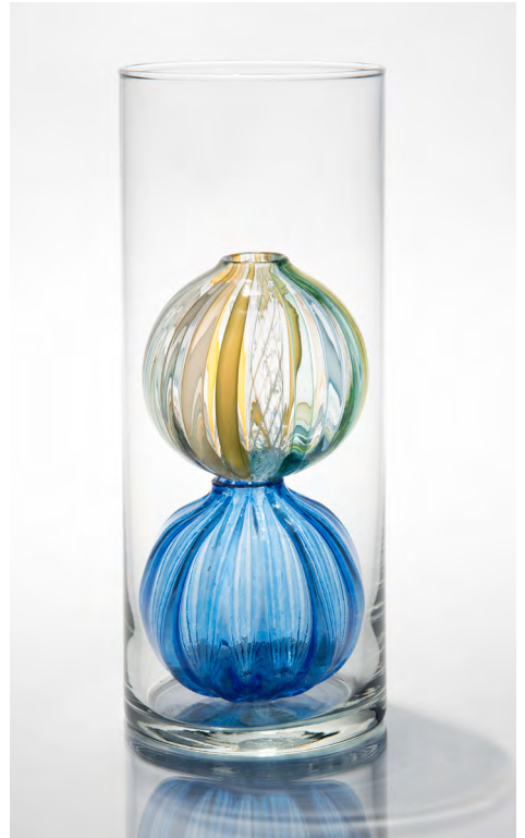
Double Globe in Turquoise/Celery Stripe and Light Blue Clear vase is 9" tall x 3.5" wide; each bead is 3" tall