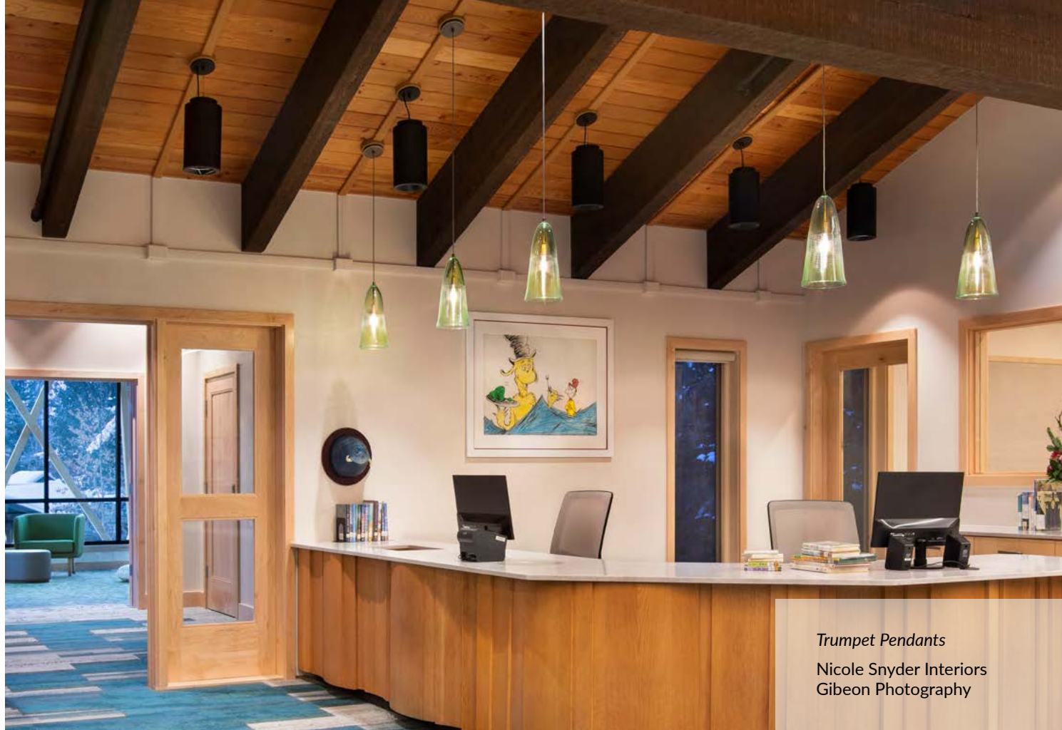
Trumpet Pendants Nicole Snyder Interiors Gibeon Photography