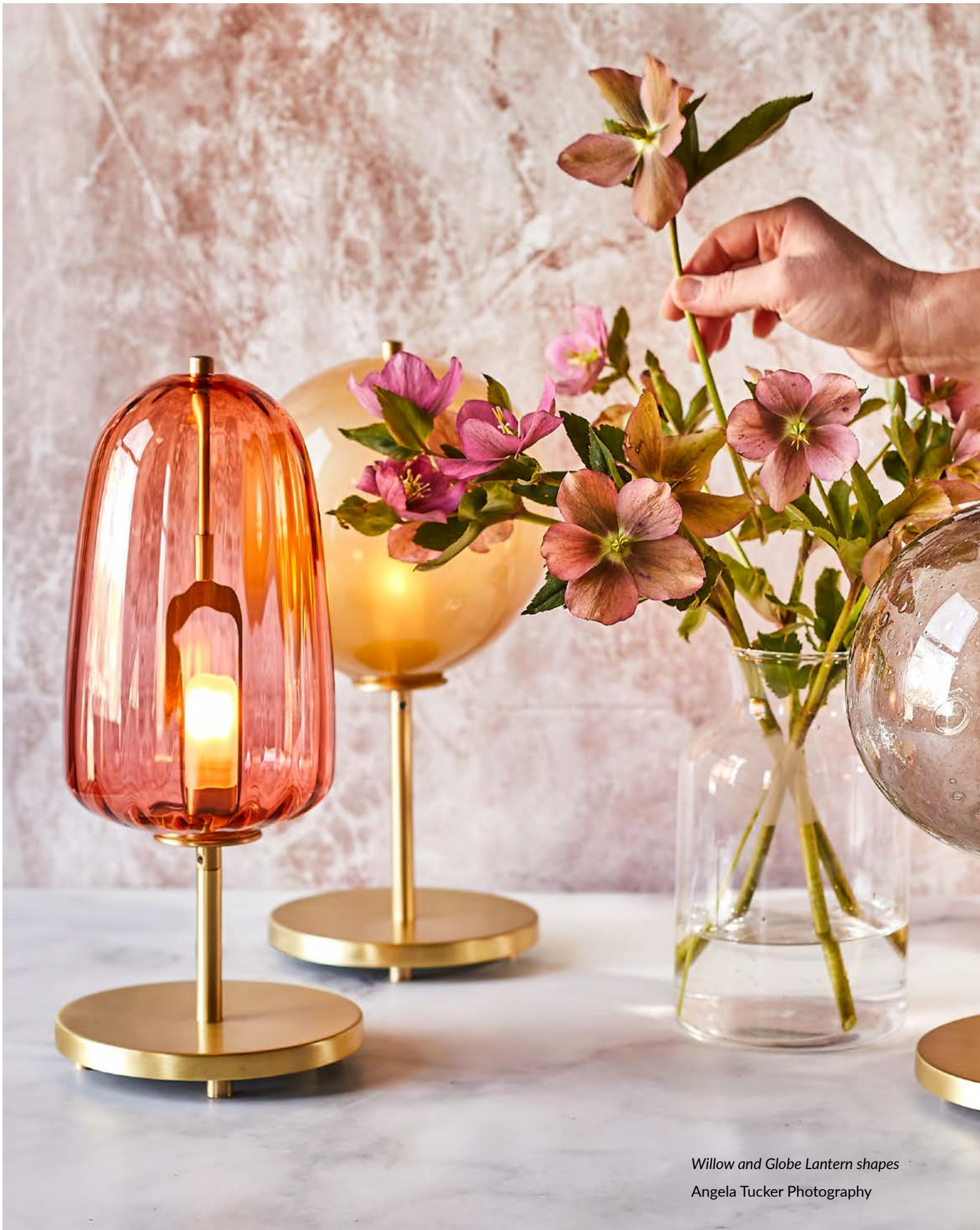
Willow and Globe Lantern shapes

Enchanted Forest Lanterns. Stylized tree shapes made from blown glass and mounted on metal trunks. Enjoy one by itself or put together your own forest.