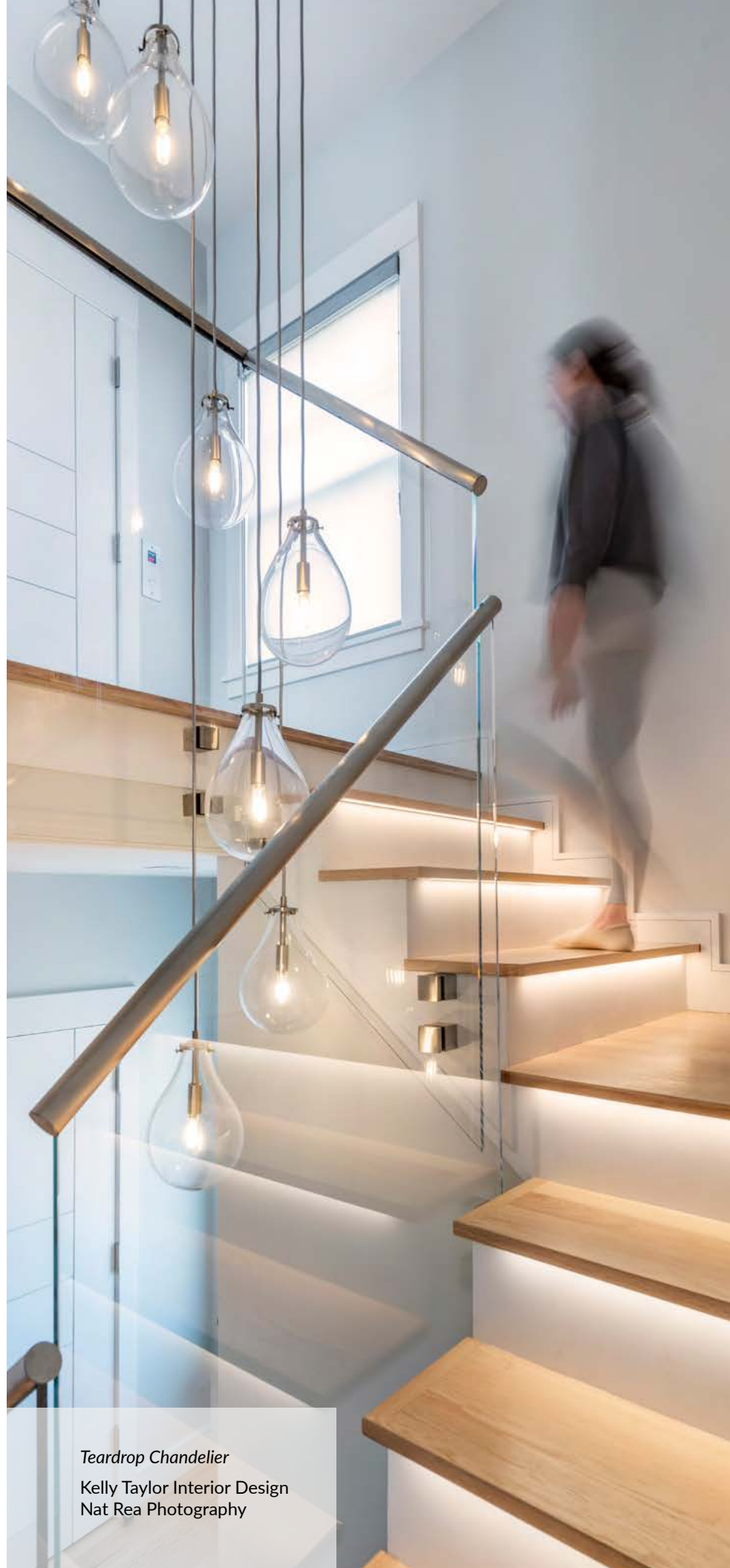
Teardrop Chandelier Kelly Taylor Interior Design

The Teardrop is a sensuous shape, reminiscent of a glassblower's bubble. It dangles lightly from a slender cord, available as a sconce or pendant, or grouped in multiples from a shared canopy.