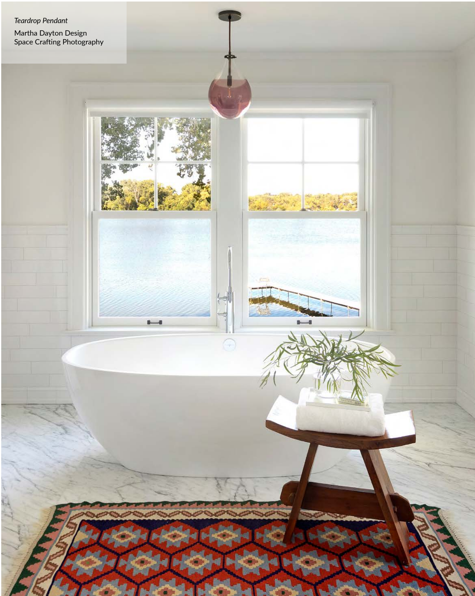
Teardrop Pendant Martha Dayton Design Space Crafting Photography