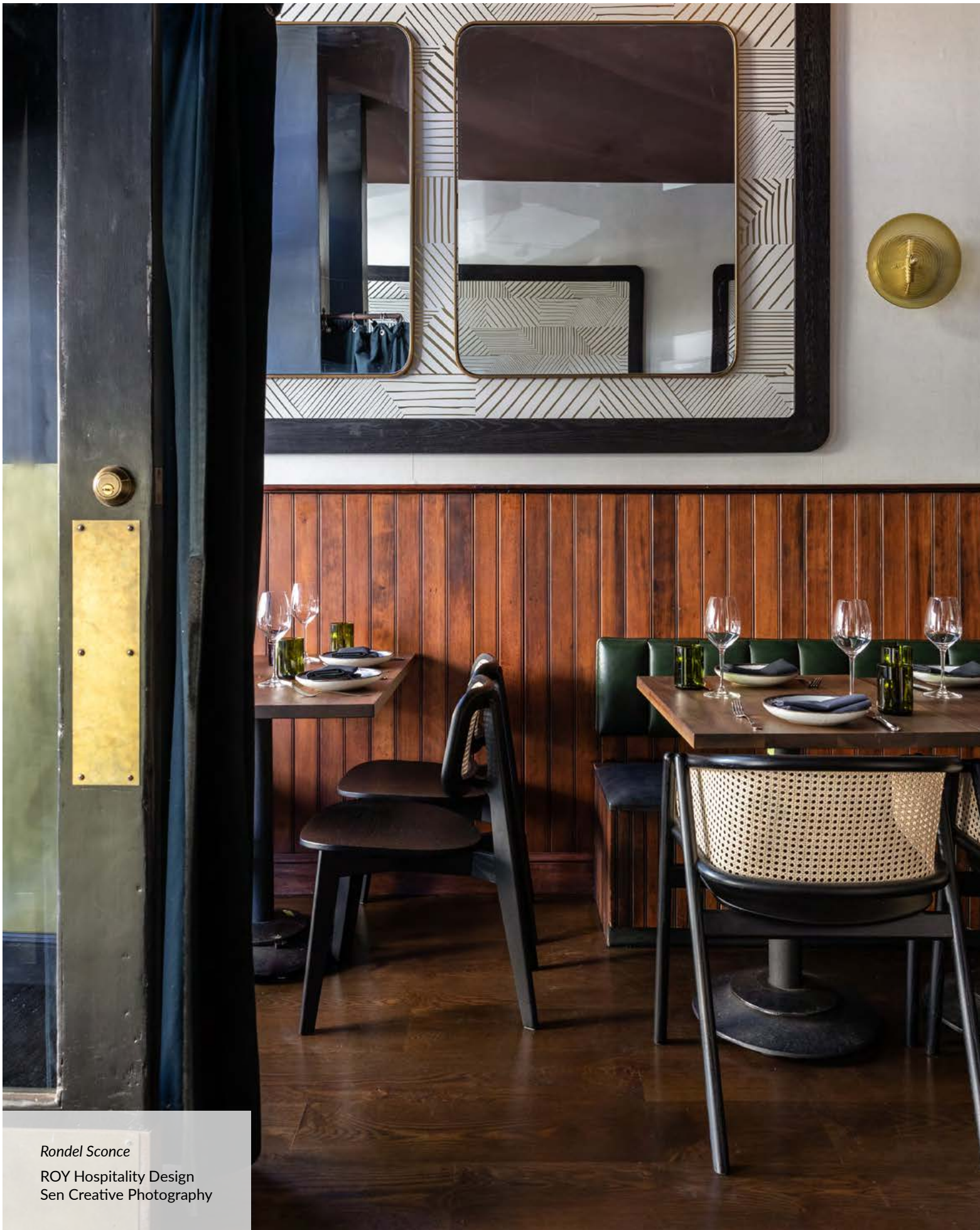
Rondel Sconce ROY Hospitality Design Sen Creative Photography