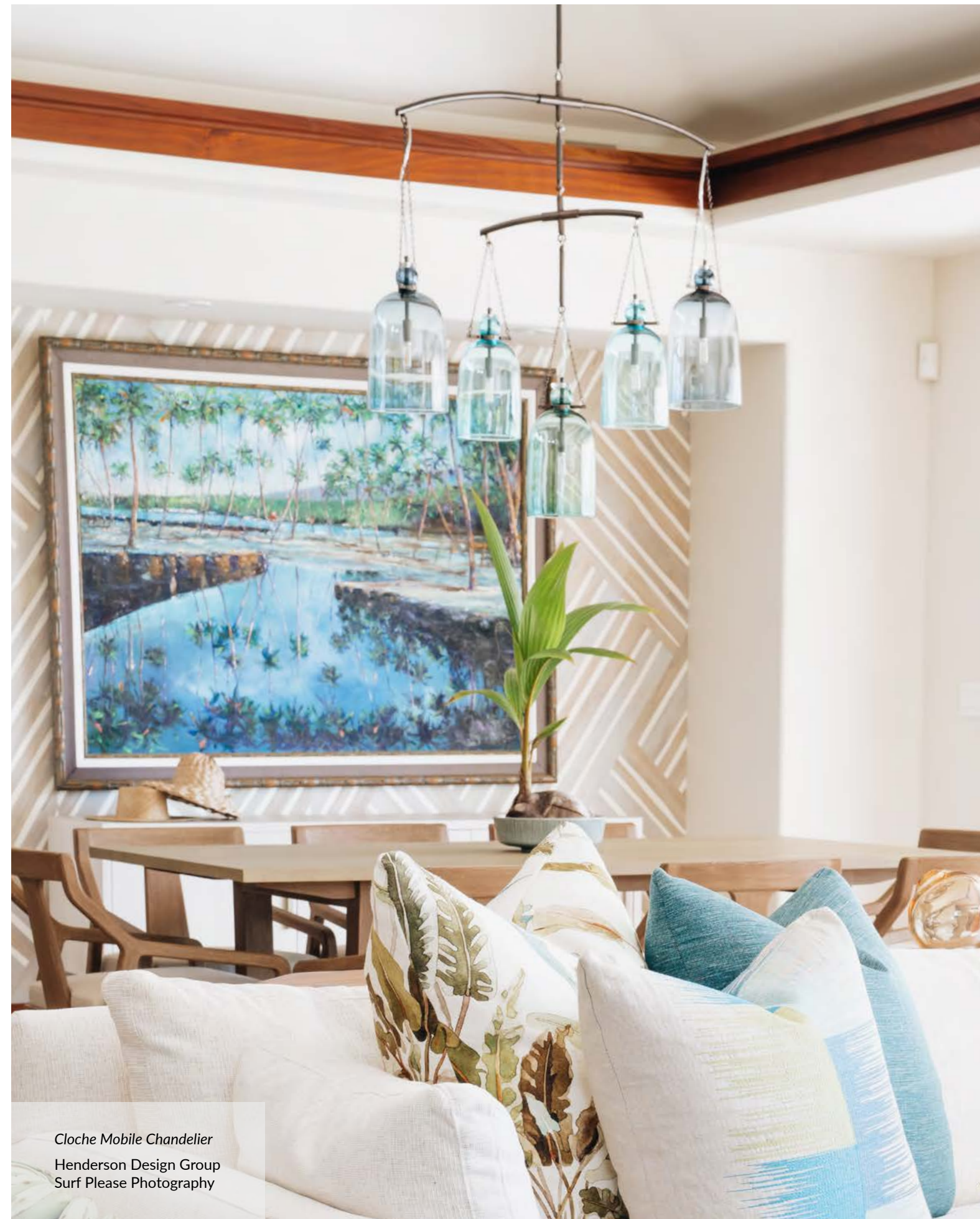
Cloche Mobile Chandelier Henderson Design Group