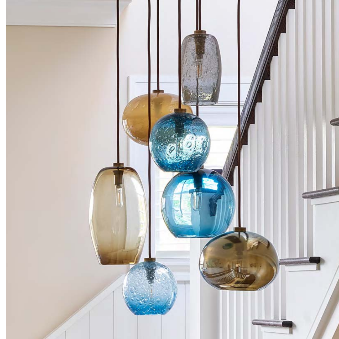
Lucia Chandelier Embellishments Interior Design