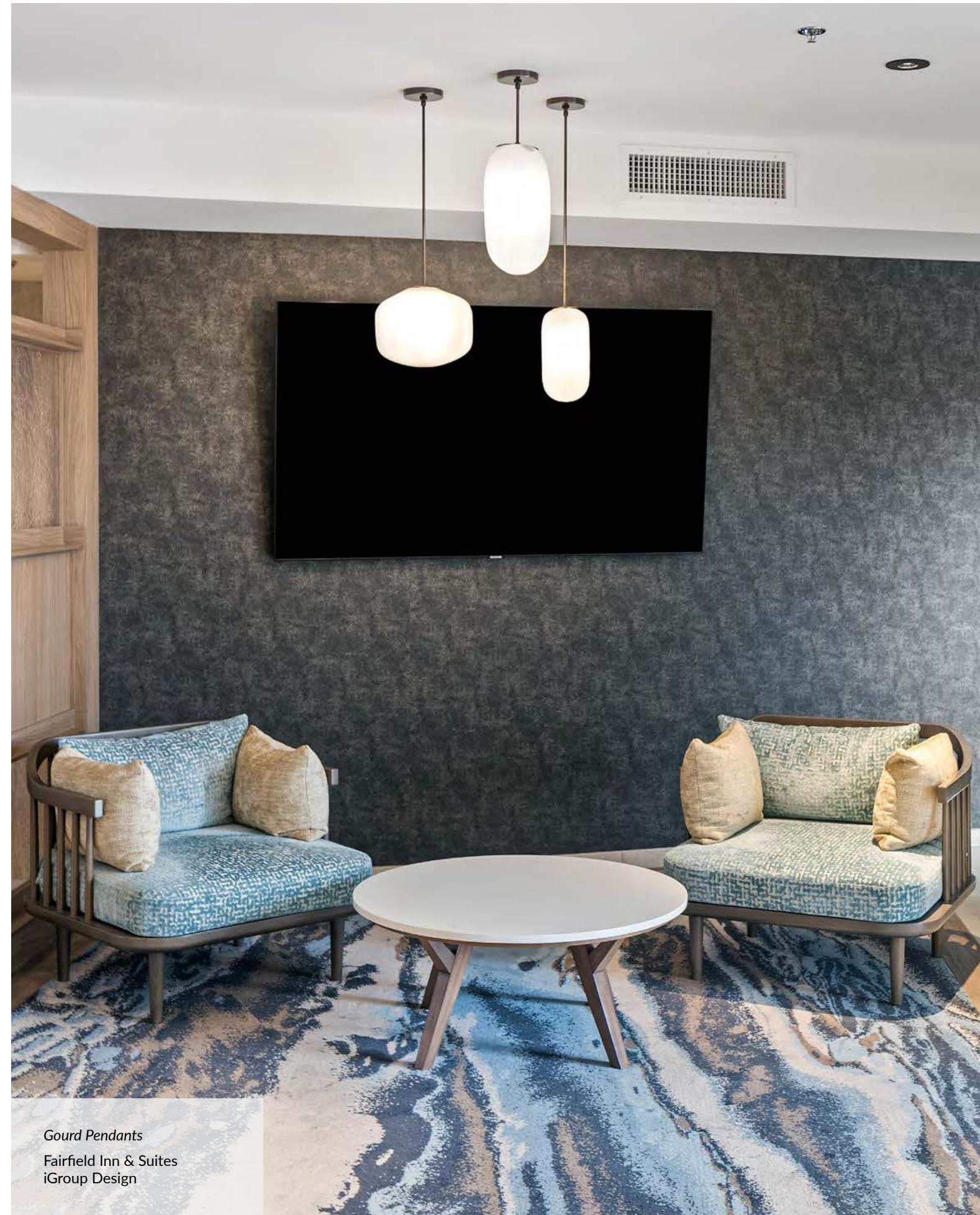
Gourd Pendants Fairfield Inn & Suites iGroup Design