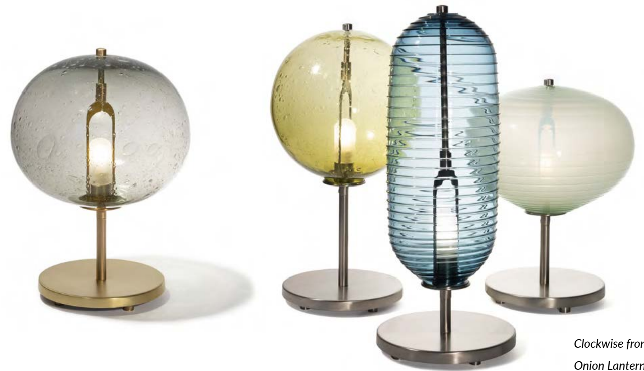
Clockwise from the left: Onion Lantern, Globe Lantern, Cypress Lantern, Onion Lantern

Cover shot: Whitney Architects Hall+Merrick+McCaugherty Photographers