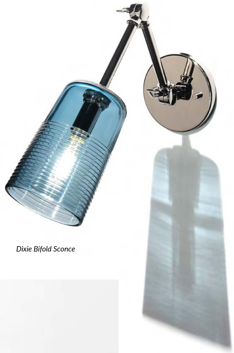
Dixie Bifold Sconce

Light the way – your way! The adjustable Dixie Sconce collection is a modern and elegant means to place a spot of light exactly where you need it.