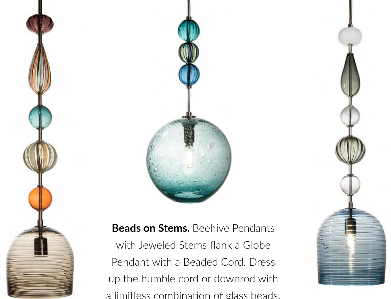
Beads on Stems. Beehive Pendants with Jeweled Stems flank a Globe Pendant with a Beaded Cord. Dress up the humble cord or downrod with a limitless combination of glass beads.