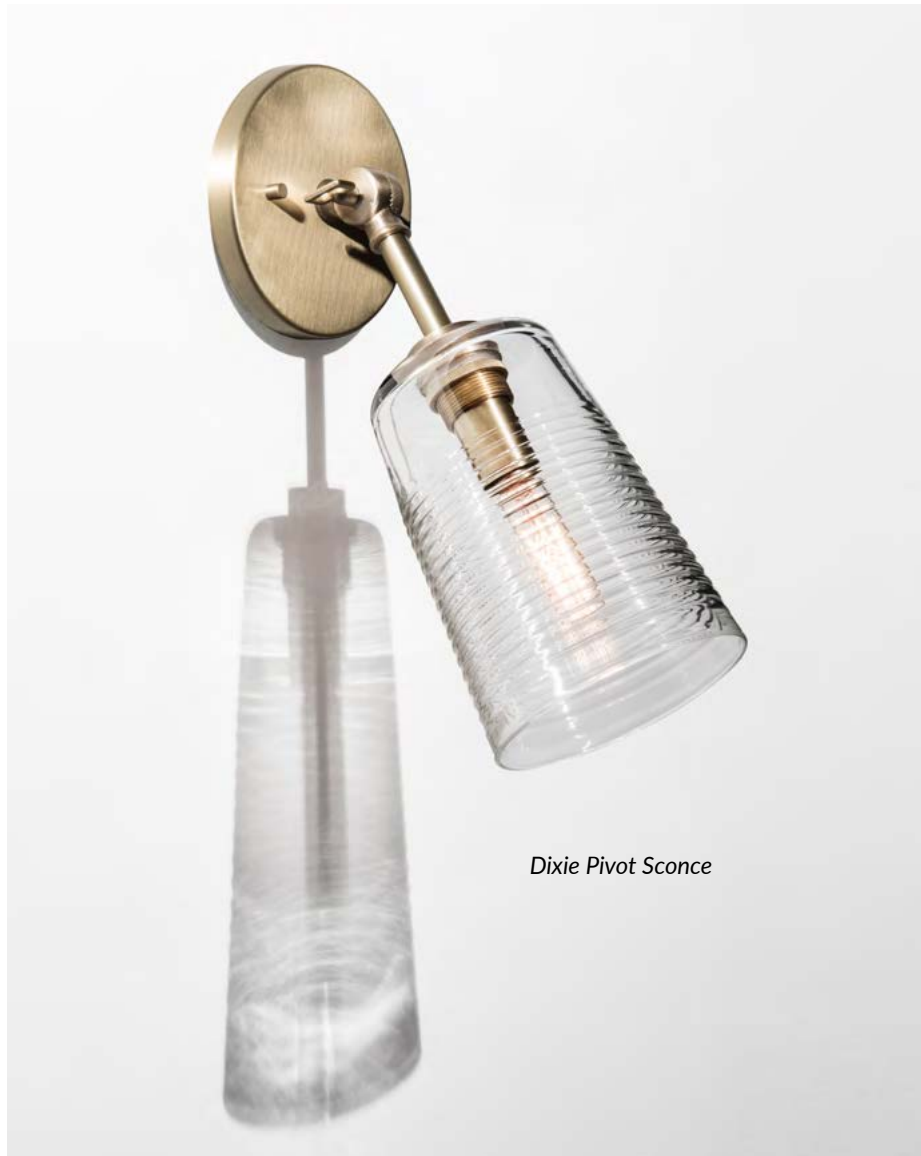
Dixie Pivot Sconce