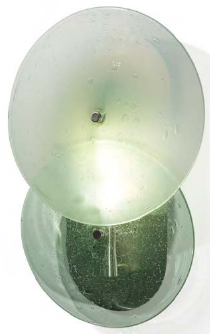
Double Rondel Sconce