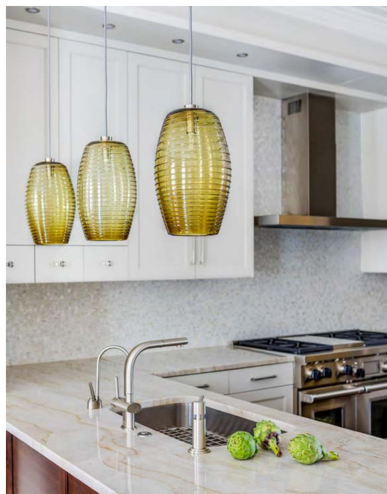
Barrel Pendants Kennernecht Design

Barrel, Canister, Dimple, Enoki, Globe, and Onion shapes can be hung from cords or downrods, solo or on multiport canopies. Also available as a sconce.