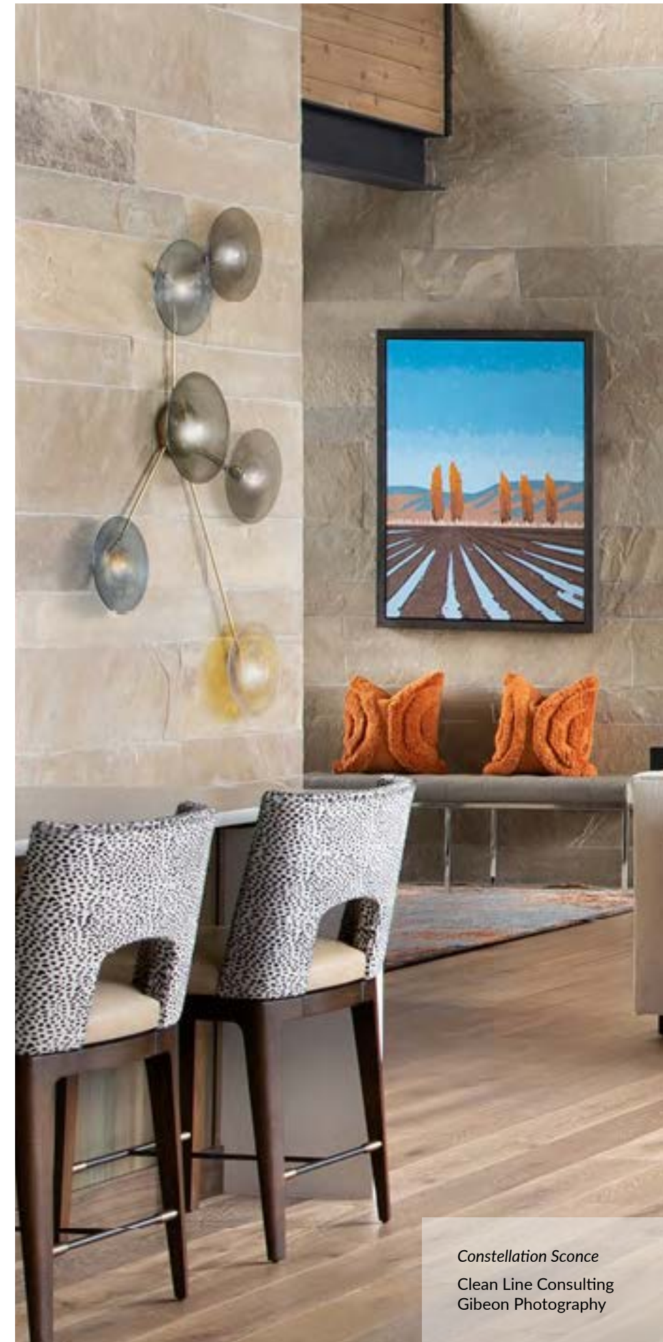
Constellation Sconce Clean Line Consulting

Use Constellation sconces and chandeliers to create your own night sky. Unique configurations available.