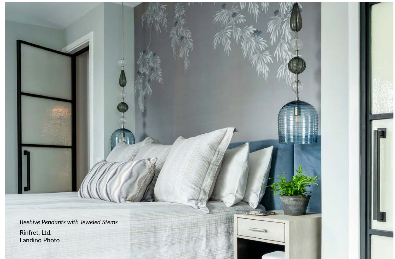
Beehive Pendants with Jeweled Stems Rinfret, Ltd. Landino Photo

Roman glass, reconfigured for modern times. Elegant and timeless, the Trumpet comes in several sizes and is also available as a sconce.