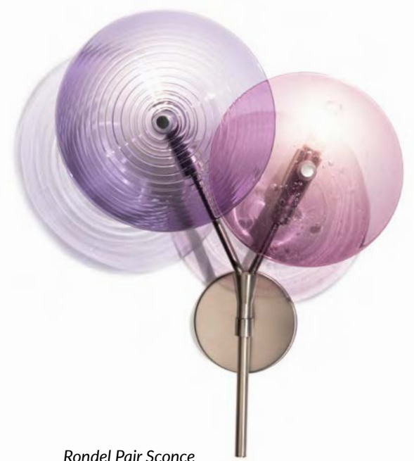
Rondel Pair Sconce