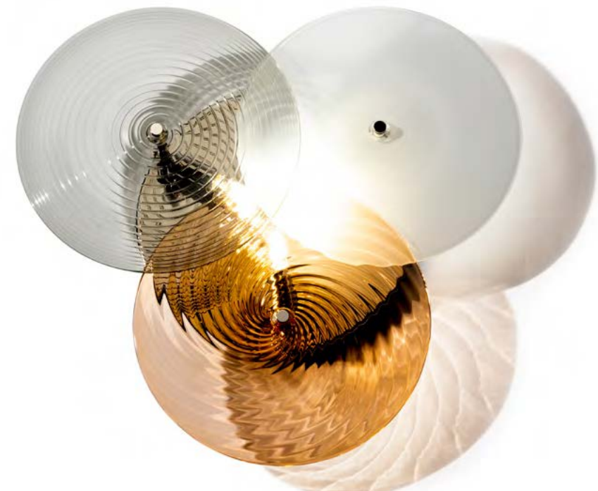
Triple Rondel Sconce