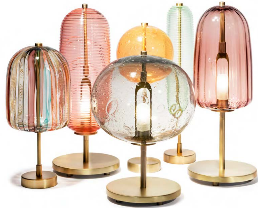
Clockwise from the left: Willow sculpture, Cypress Lantern, Globe sculpture, Cypress sculpture, Willow Lantern, Onion Lantern

Enchanted Forest Lanterns. Stylized tree shapes made from blown glass and mounted on metal trunks. Enjoy one by itself or put together your own forest.