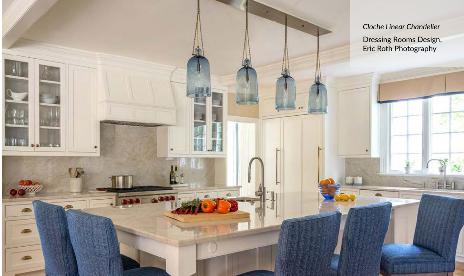
Cloche Linear Chandelier Dressing Rooms Design

Cloche Collection. Cloches hung singly as pendants and sconces, balanced delicately from mobiles, and lined up smartly on linear canopies.