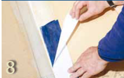
Joining softwood fibre roof underlay

8 Prime sub-roofs made of softwood fibre panels with TESCO PRIMER RP in the area of the bond (e.g. in grooves). Tape down using 15 cm wide TESCO VANA multi-purpose adhesive tape for indoor and outdoor use.