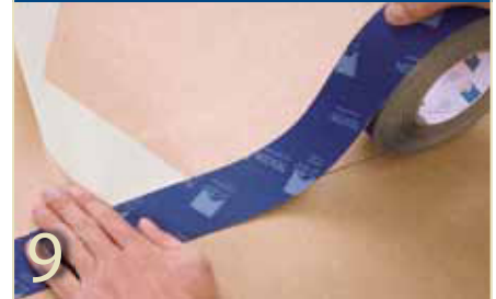
Joining wood fibre boards

9 Use TESCO VANA for sub-roofs made of wood-based panels (ie. GUTEX). Place the tape centrally over the butt joint, unroll and stick down over the joint piece by piece. Press firmly to secure the tape.