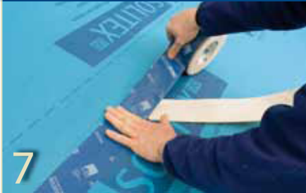
Joining SOLITEX roof underlay

7 Use TESCO VANA to bond roof lining membrane (e.g. pro clima SOLITEX). Place the tape centrally over the overlap, unroll and stick down over the joint piece by piece. Press firmly to secure the tape, ensuring there is sufficient back-pressure.