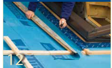
Detail: Foil gutter

12 Place a strip of membrane in the overlap of the closest uninterrupted sheet of membrane and stick down. Fold the unattached end of the membrane strip over and affix it to the lathing to drain the moisture to the next section of the roof using an interrupted counter batten.