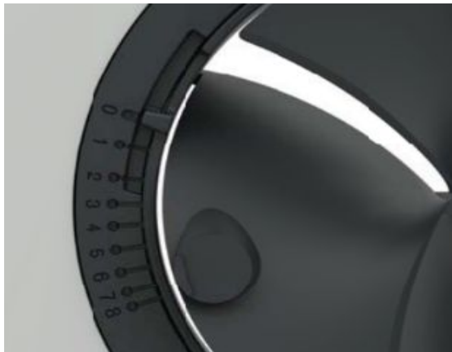
9-step air flow balancing valve