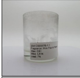
End of Burn Front- Sample 1