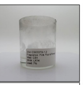
End of Burn Front- Sample 2