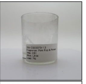
End of Burn Front- Sample 3