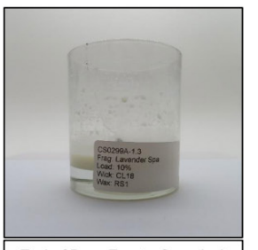
End of Burn Front - Sample 3