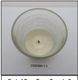
End of Burn Top - Sample 2