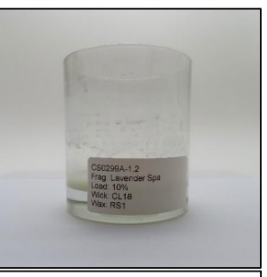
End of Burn Front - Sample 2