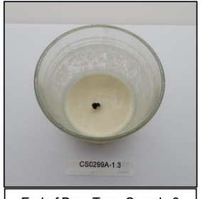
End of Burn Top - Sample 3