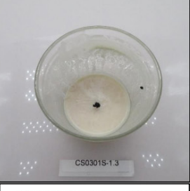
End of Burn Top - Sample 3