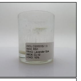
End of Burn Front- Sample 3