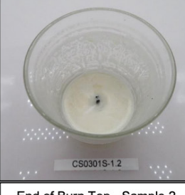
End of Burn Top - Sample 2