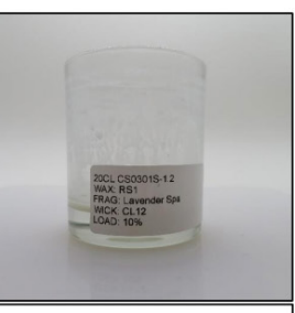
End of Burn Front- Sample 2