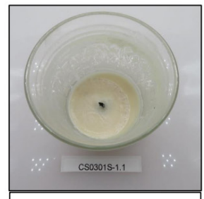
End of Burn Top - Sample 1