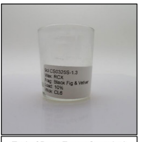
End of Burn Front- Sample 3