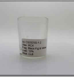
End of Burn Front- Sample 2