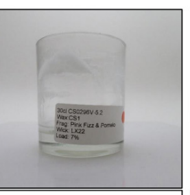
End of Burn Front - Sample 2