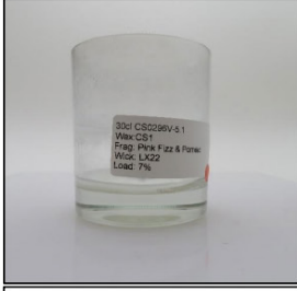
End of Burn Front - Sample 1