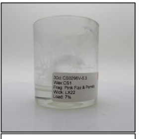
End of Burn Front - Sample 3