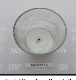
End of Burn Top - Sample 2