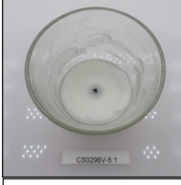
End of Burn Top - Sample 1