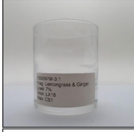
End of Burn Front- Sample 1