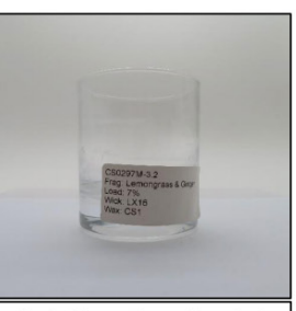
End of Burn Front- Sample 2