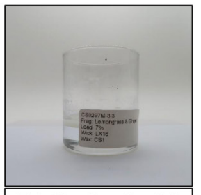
End of Burn Front- Sample 3