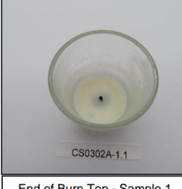
End of Burn Top - Sample 1