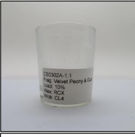
End of Burn Front- Sample 1