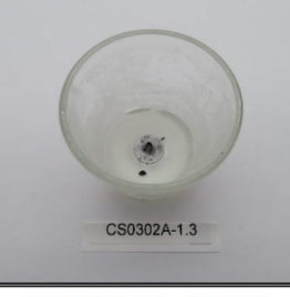
End of Burn Top - Sample 3