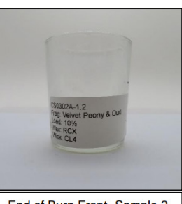
End of Burn Front- Sample 2