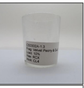
End of Burn Front- Sample 3