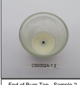
End of Burn Top - Sample 2