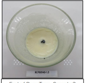
End of Burn Top - Sample 3