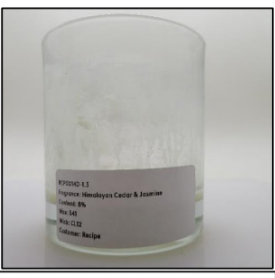
End of Burn Front - Sample 3