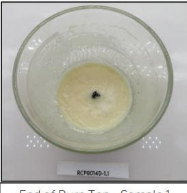
End of Burn Top - Sample 1