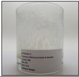
End of Burn Front - Sample 1