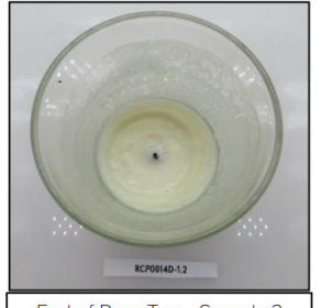
End of Burn Top - Sample 2