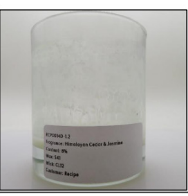
End of Burn Front - Sample 2