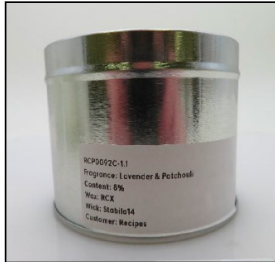
End of Burn Front - Sample 1