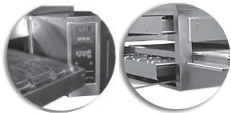
Removable panels for easy cleaning