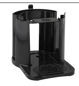
STAND ASSY, TF SERVER