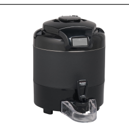
TF SERVER, DSG2 1G BLK NOBASE