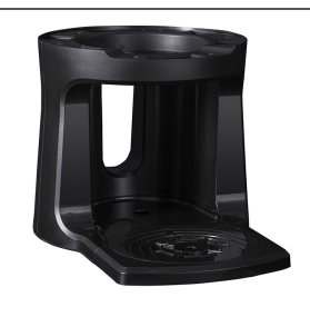
STAND ASSY KIT, TF SERVER