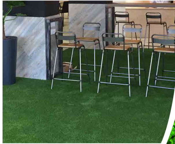
8318H BRIGHT GREEN