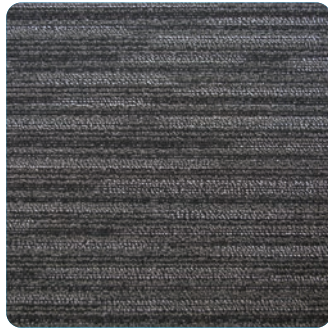
7202 SILVER MOON