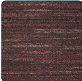
*7205 VELVET MARS *Discontinued Design