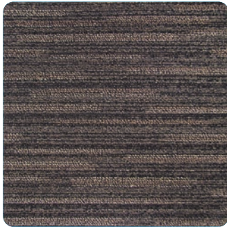
*7201 VENUS BEIGE *Discontinued Design