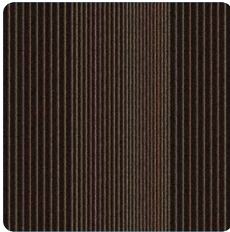
5971 HASHTAG BROWN