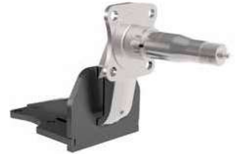
4" Drop Long