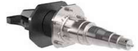
2" Lift Long