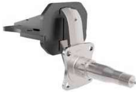
4" Lift Long