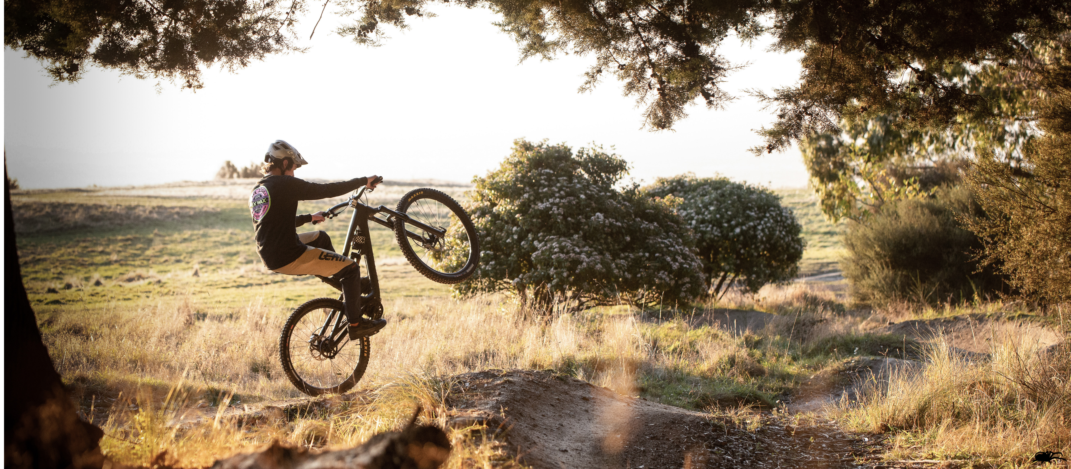
Rider: Jack Derry