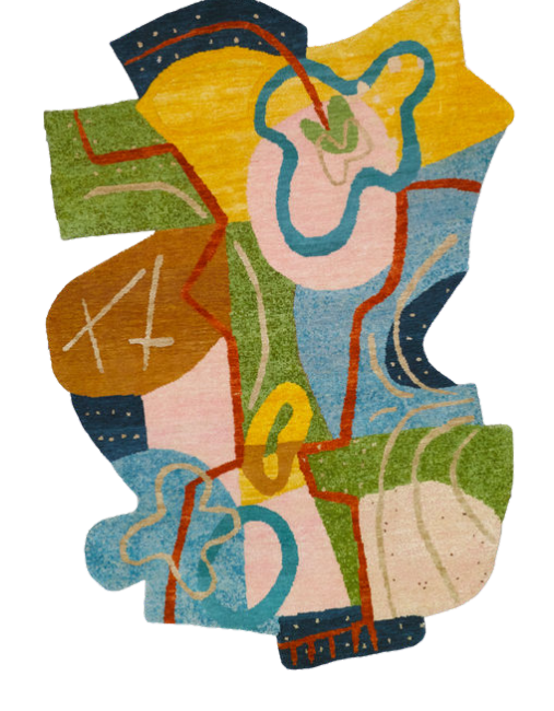
BOUNCE - I