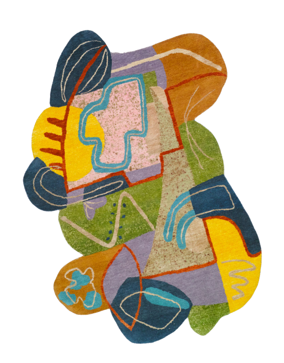
BOUNCE - II