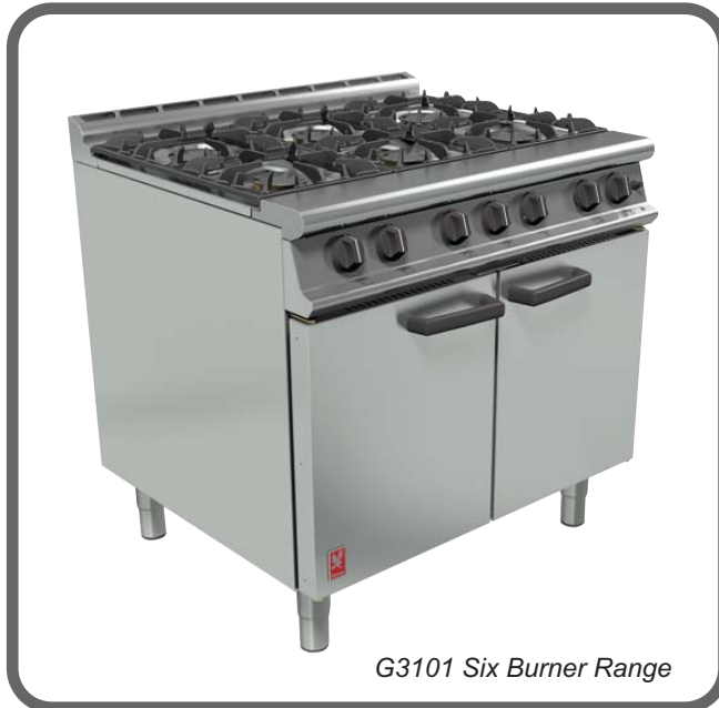
G3101 Six Burner Range