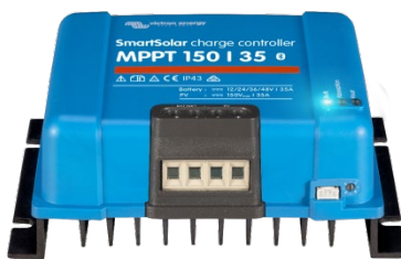
SmartSolar Charge Controller MPPT 150/35