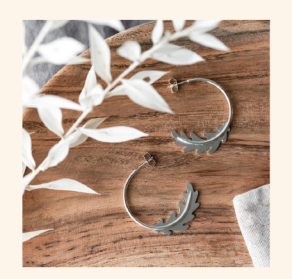
SILVER OAKLEAF HOOPS