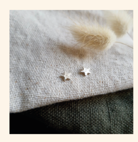
TINY SILVER STAR EARRINGS