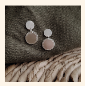
DAPPLED SUNLIGHT EARRINGS