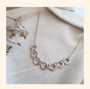
SILVER AFFINITY NECKLACE