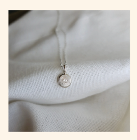
MINI WHITE TOPAZ NECKLACE