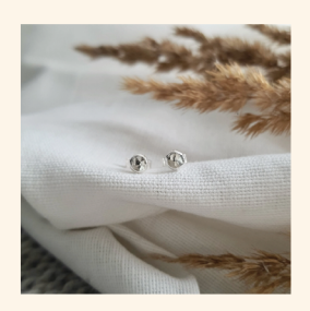
SILVER PEBBLE STUDS