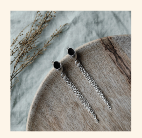
SILVER POD CHAIN EARRINGS