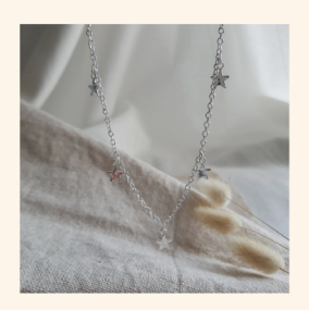
SILVER STAR MULTI NECKLACE