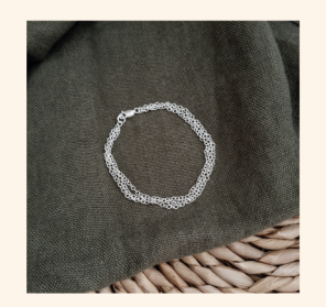
SILVER MULTI CHAIN BRACELET