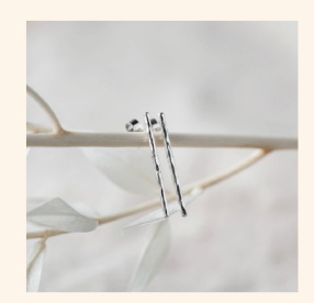
HAMMERED SILVER BAR EARRINGS

We have a collection of stunning gift ideas for those we want to buy just a little treat. Our gifts under £25 are perfect for friends school teachers and relatives — those who you want to spoil with a little something special.