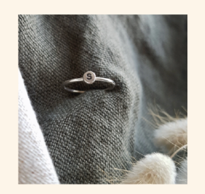
SILVER INITIAL STACKING RING