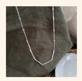
HAMMERED SILVER BAR NECKLACE

We all have those special people in our lives that we want to truly know how much they mean to us. Send a gift that lets them know just how much you love, care and appreciate them. Our Gifts That Say More collection does exactly that. Gifts that say the words you sometimes struggle to find.