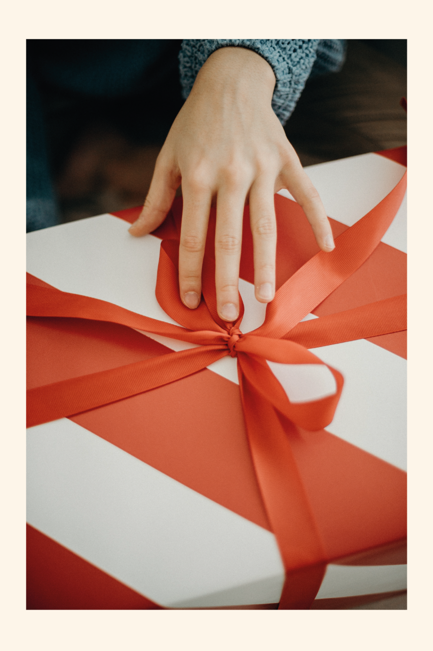
GIFTING WITH ANNA CALVERT JEWELLERY WWW.ANNACALVERT.CO.UK