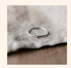
SILVER & GOLD STACKING RING