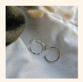
HAMMERED SILVER HOOP EARRINGS

Sometimes we want to treat someone to something a little extra special; something we know they will love and cherish forever. Our Extra Special gift collection will give you plenty of ideas to send a special gift with a little extra meaning.