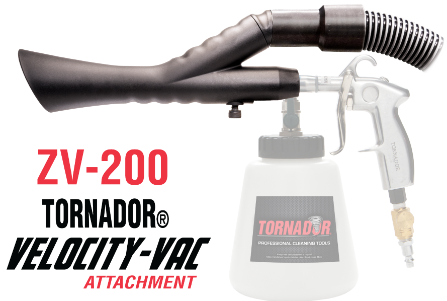
ZV-200 TORNADOR® VELOCITY-VAC ATTACHMENT