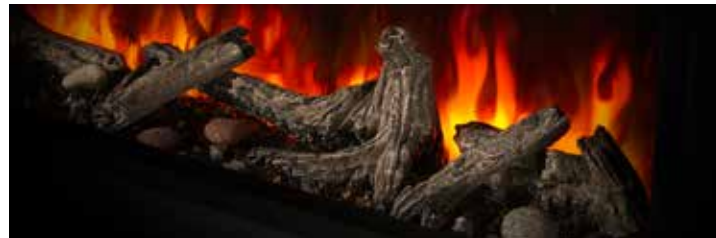
INCLUDED: Driftwood Logs with Woodland Kit