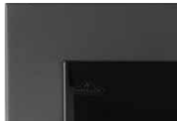
1pc. adjustable finishing trim included