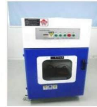
Negative pressure tester