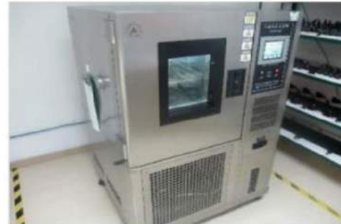
High and low temperature tester