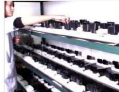
Battery durability test 2