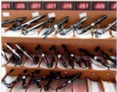
Battery durability tester 1