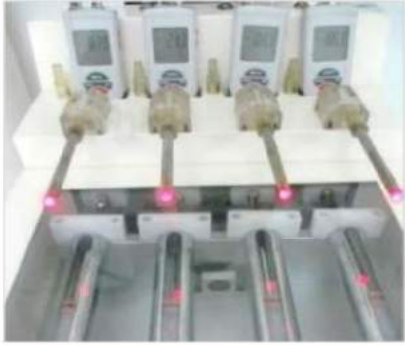
Puffs count tester