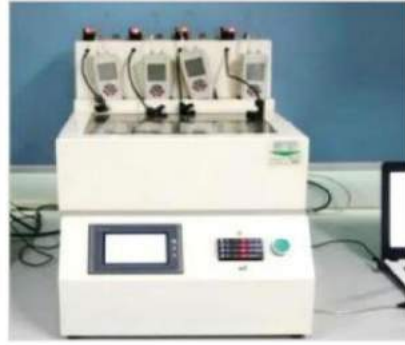
Smoke density tester